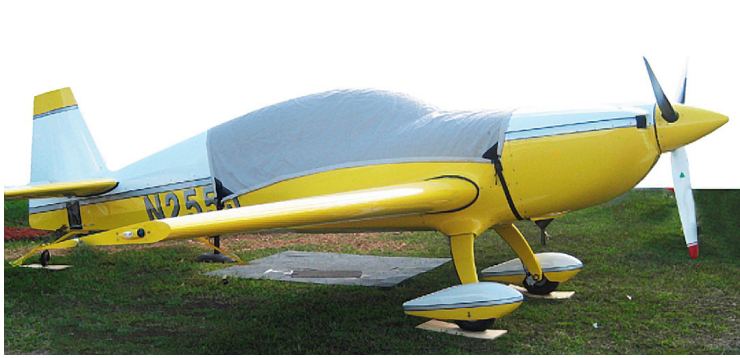
Xtremeair Canopy Cover