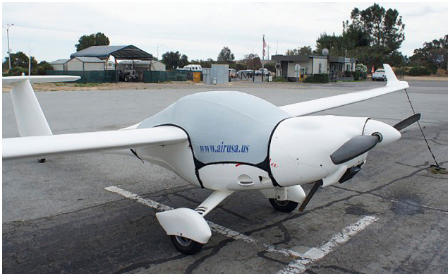
Lambada Travel Canopy Cover