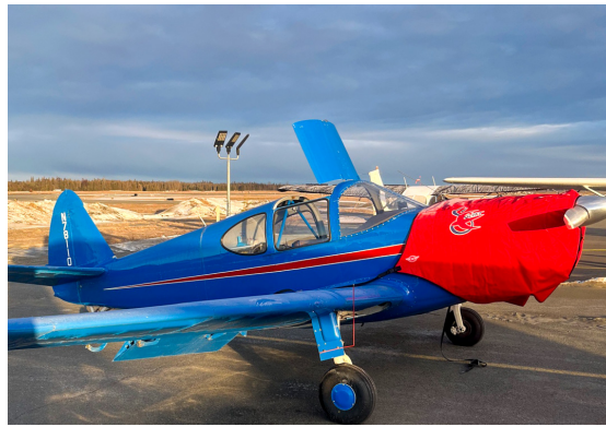
Globe Swift Insulated Engine Cover

This cover type is made from Silver Acrylic Sunbrella canvas and is 100% lined with a soft and smooth microfiber. Bruce's Custom Covers developed this material combination especially for aircraft protection. The outer material is medium weight and treated for water resistance, UV resistance and anti-static buildup. The inner lining is a very soft and smooth microfiber to prevent scratching. The material is very reflective, and tests show that the cabin interior temperature can be reduced to near-ambient temperature on the hottest of days. It is water, ice and snow repellent, yet breathable to allow moisture to escape from between the cover and the aircraft surface.