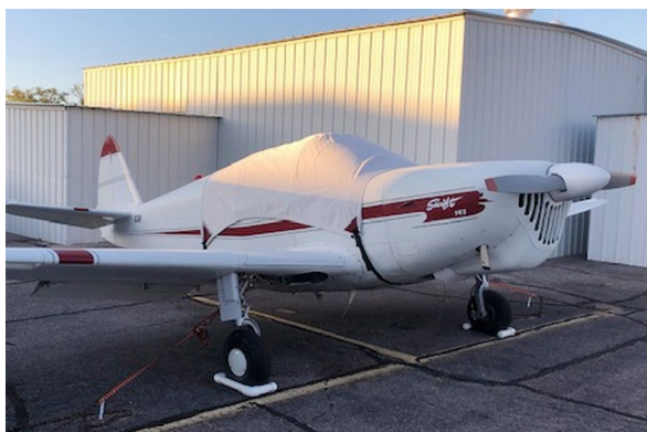
Globe-Temco Swift Canopy Cover, standard type

This cover type is made from Silver Acrylic Sunbrella canvas and is 100% lined with a soft and smooth microfiber. Bruce's Custom Covers developed this material combination especially for aircraft protection. The outer material is medium weight and treated for water resistance, UV resistance and anti-static buildup. The inner lining is a very soft and smooth microfiber to prevent scratching. The material is very reflective, and tests show that the cabin interior temperature can be reduced to near-ambient temperature on the hottest of days. It is water, ice and snow repellent, yet breathable to allow moisture to escape from between the cover and the aircraft surface.