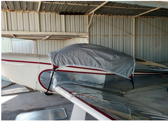
Globe GC-1B Lightweight Travel Cover