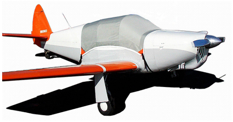
Standard Canopy Cover for Swift