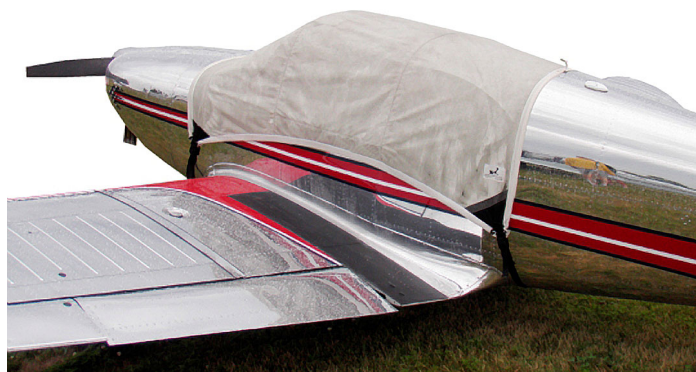
Swift Canopy Cover