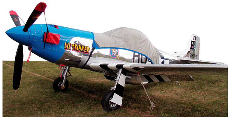
Stewart Mustang Canopy Cover, Prop Tie Downs & Intake Plugs