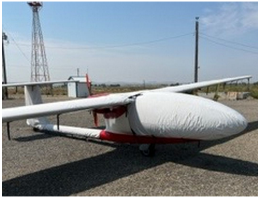
SZD-45 Ogar Canopy/Nose, Wings & Empennage Covers