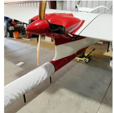
SZD-45 Ogar Empennage Cover