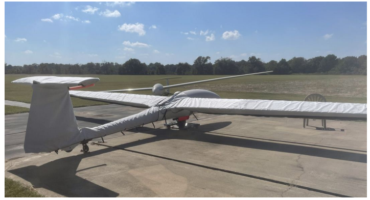
Pdps Pzl-Bielsko SZD-48-3