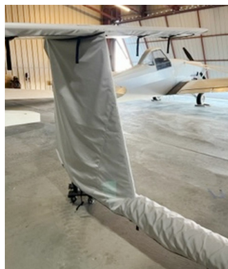
SZD-45 Ogar Empennage Cover

WINTER USE MATERIAL - Made with Solution-Dyed Polyester fabric, this option is intended for seasonal use to aid in deicing, rain mitigation, or for occasional travel. The material is lighter and more compact, but more susceptible to UV damage and may have a shorter useful life if used continuously outside than the all-year use material.