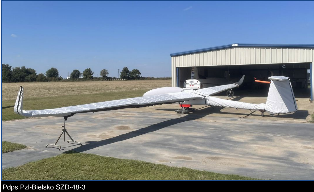
Pdps Pzl-Bielsko SZD-48-3