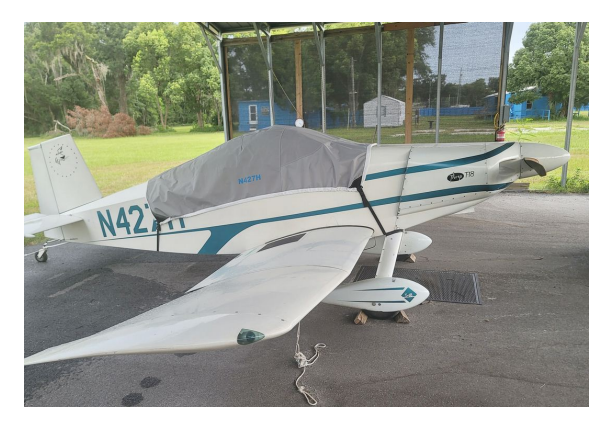
Thorp T-18 Travel Cover

Travel Covers are made with Silver Solution-Dyed Polyester fabric and only lined over the windshield to save weight. The material is lightweight and more compact for easy stowage in the aircraft. The polyester material is water resistant, but only intended for occasional use outside. We also have an ultra lightweight material available for fitted hangar dust covers. For daily outdoor use, the non-travel Sunbrella Cover is the best choice.