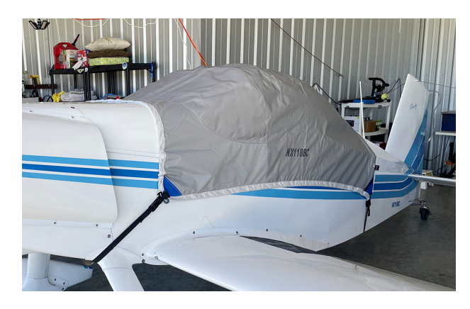
T-18 Travel Cover, Light Weight Canopy Cover (Bubble Canopy)