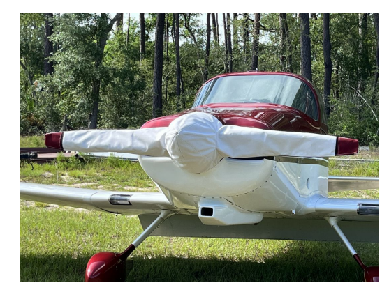
Mustang 2 Prop/Spinner Cover

This cover type is made from Silver Acrylic Sunbrella canvas and is 100% lined with a soft and smooth microfiber. Bruce's Custom Covers developed this material combination especially for aircraft protection. The outer material is medium weight and treated for water resistance, UV resistance and anti-static buildup. The inner lining is a very soft and smooth microfiber to prevent scratching. The material is very reflective, and tests show that the cabin interior temperature can be reduced to near-ambient temperature on the hottest of days. It is water, ice and snow repellent, yet breathable to allow moisture to escape from between the cover and the aircraft surface.