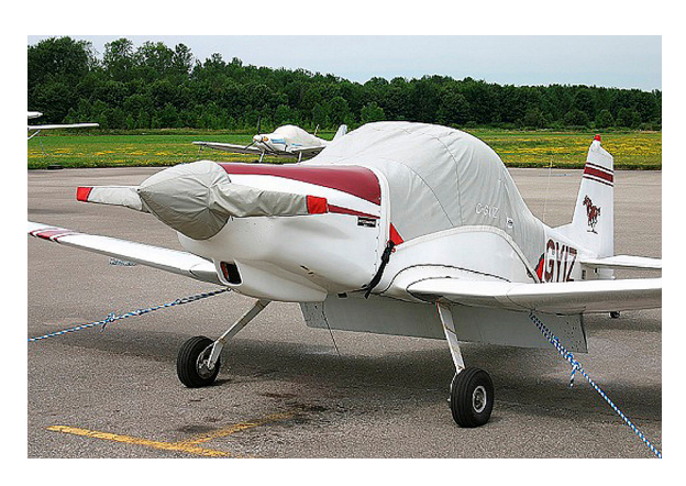
Bushby Mustang Canopy cover and Propellor/Spinner cover