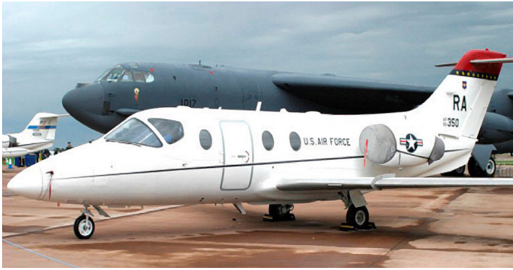
T-1A Jayhawk (Beechjet) Engine & Pitot Cover set

of medium weight nylon which is available in a variety of colors to match the paint trim. Each cover set comes complete with installation and folding instructions. The aircraft's registration number can be silkscreened onto the cover for an extra charge.