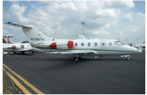
Beechjet 400 Engine Covers