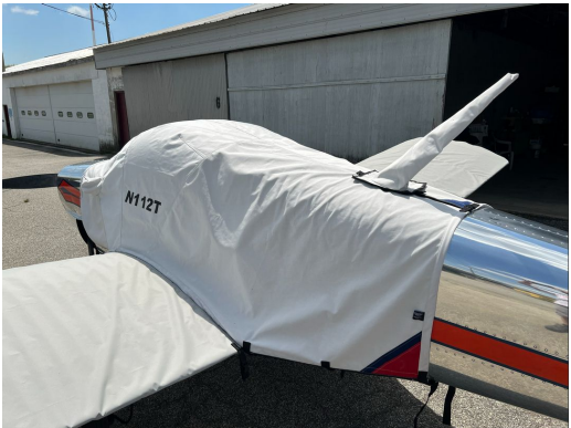
Thorp Sky Scooter Extended Canopy Cover & Wing Covers