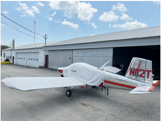
Thorp Sky Scooter Extended Canopy Cover & Wing Covers