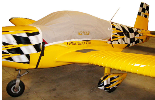
Indus Thorpedo Canopy Cover

This cover type is made from Silver Acrylic Sunbrella canvas and is 100% lined with a soft and smooth microfiber. Bruce's Custom Covers developed this material combination especially for aircraft protection. The outer material is medium weight and treated for water resistance, UV resistance and anti-static buildup. The inner lining is a very soft and smooth microfiber to prevent scratching. The material is very reflective, and tests show that the cabin interior temperature can be reduced to near-ambient temperature on the hottest of days. It is water, ice and snow repellent, yet breathable to allow moisture to escape from between the cover and the aircraft surface.