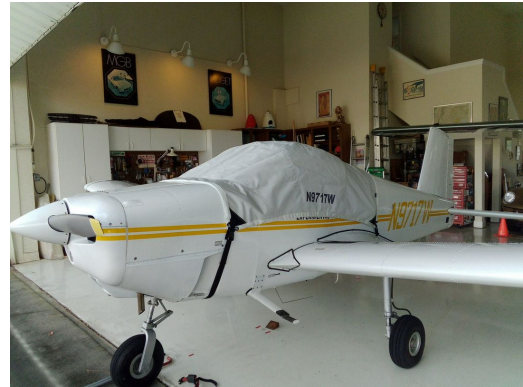
Thorp Sky Scooter T211 Canopy Cover