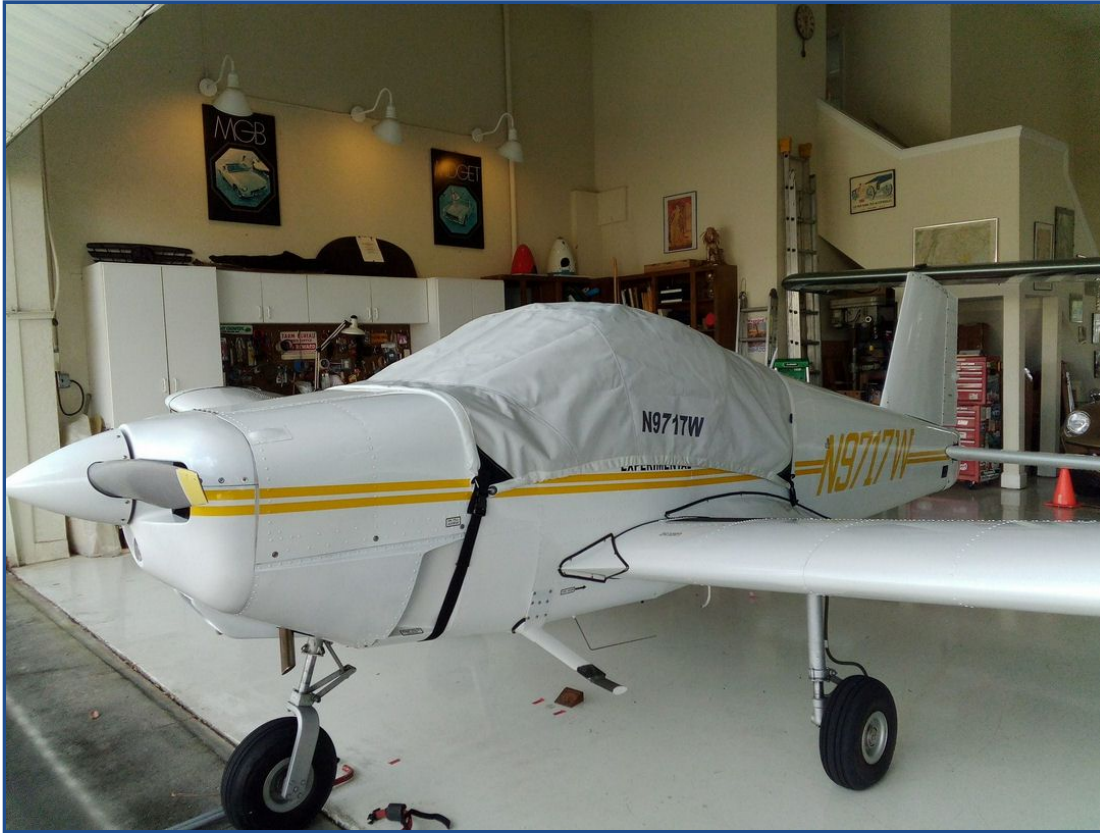
Thorp Sky Scooter T211 Canopy Cover