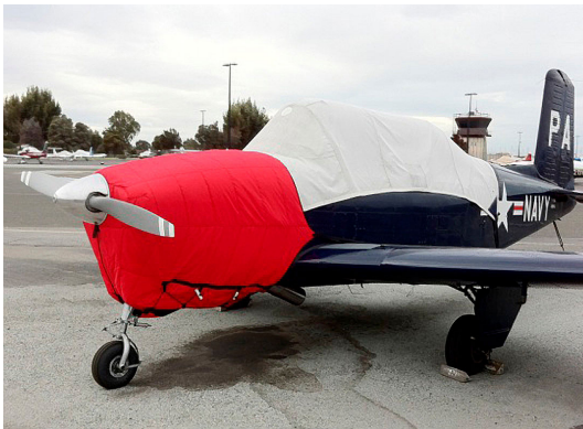
T-34A Insulated Engine Cover

This cover type is made from Silver Acrylic Sunbrella canvas and is 100% lined with a soft and smooth microfiber. Bruce's Custom Covers developed this material combination especially for aircraft protection. The outer material is medium weight and treated for water resistance, UV resistance and anti-static buildup. The inner lining is a very soft and smooth microfiber to prevent scratching. The material is very reflective, and tests show that the cabin interior temperature can be reduced to near-ambient temperature on the hottest of days. It is water, ice and snow repellent, yet breathable to allow moisture to escape from between the cover and the aircraft surface.