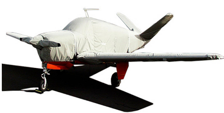
Beech Bonanza Full Cover Set

WINTER USE MATERIAL - Made with Solution-Dyed Polyester fabric, this option is intended for seasonal use to aid in deicing, rain mitigation, or for occasional travel. The material is lighter and more compact, but more susceptible to UV damage and may have a shorter useful life if used continuously outside than the all-year use material.