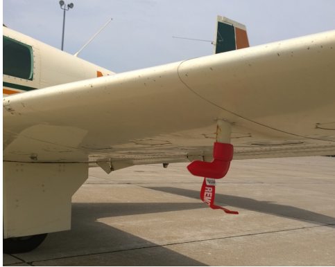
Mooney Pitot Cover

of the plugs. Most plugs are imprinted with the aircraft registration number in black for an extra charge. Storage bag NOT included. Engine plugs may be inserted after flight when the engine is still warm. Engine Inlet Plugs are commonly referred to as Cowl Plugs, Intake Plugs, Cowl Blocks, Engine Blocks, and Engine Bungs.