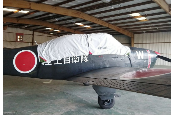
Fuji LM Canopy Cover