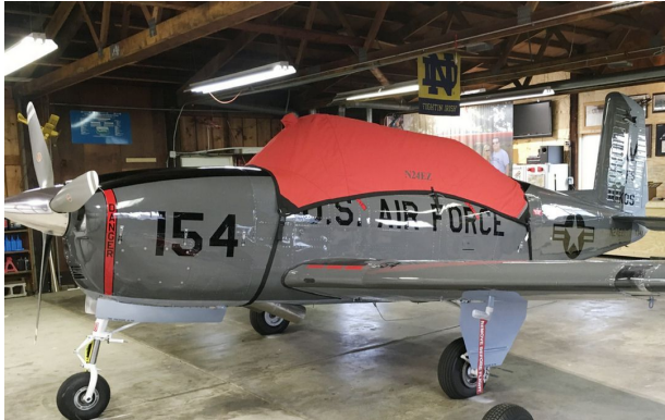
Custom T-34 Canopy Cover

This cover type is made from Silver Acrylic Sunbrella canvas and is 100% lined with a soft and smooth microfiber. Bruce's Custom Covers developed this material combination especially for aircraft protection. The outer material is medium weight and treated for water resistance, UV resistance and anti-static buildup. The inner lining is a very soft and smooth microfiber to prevent scratching. The material is very reflective, and tests show that the cabin interior temperature can be reduced to near-ambient temperature on the hottest of days. It is water, ice and snow repellent, yet breathable to allow moisture to escape from between the cover and the aircraft surface.