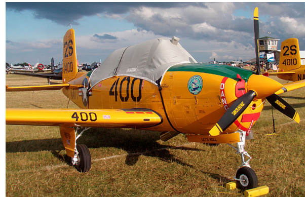
T34 Canopy Cover & Engine Inlet Plugs