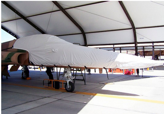
Northup F-5 Talon Canopy/Nose Cover

Travel Covers are made with Silver Solution-Dyed Polyester fabric and only lined over the windshield to save weight. The material is lightweight and more compact for easy stowage in the aircraft. The polyester material is water resistant, but only intended for occasional use outside. We also have an ultra lightweight material available for fitted hangar dust covers. For daily outdoor use, the non-travel Sunbrella Cover is the best choice.