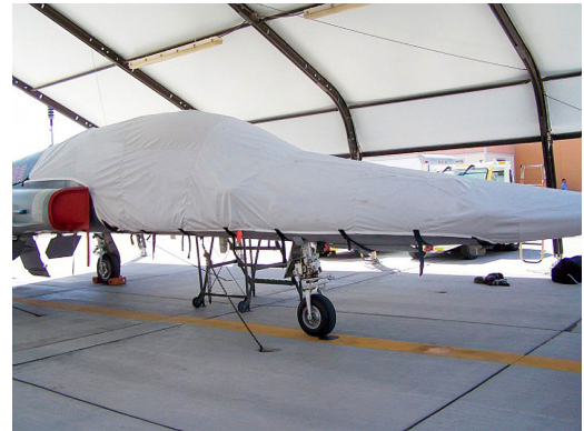
Northup F5 Talon Canopy Cover