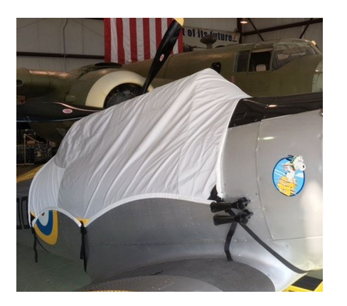
North American T6 Canopy Cover