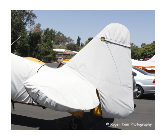
North American T6 Empennage Cover