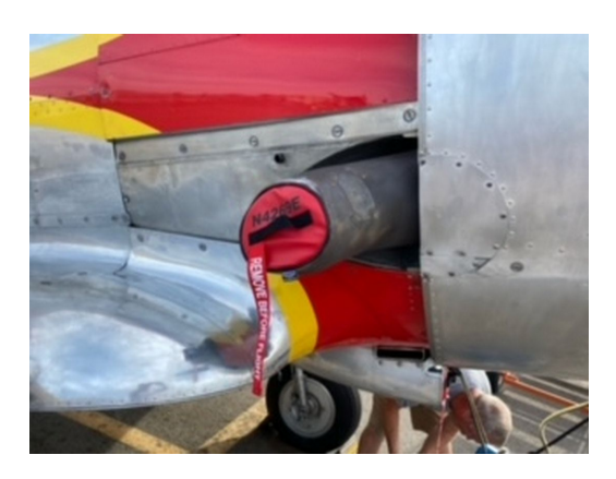
North American T6 Chin Exhaust Plug

Engine Inlet Plugs are custom fit for your North American T6, SNJ, Harvard intakes, made with heavy-duty vinyl material, and stuffed with a single block of sculpted urethane foam. Each plug has a zipper that allows the foam to be removed and dried if necessary. Engine plugs have warning flags that are visible from the cockpit or 'remove before flight' streamers sewn onto the face of the plugs. Most plugs are imprinted with the aircraft registration number in black for an extra charge. Storage bag NOT included. Engine plugs may be inserted after flight when the engine is still warm. Engine Inlet Plugs are commonly referred to as Cowl Plugs, Intake Plugs, Cowl Blocks, Engine Blocks, and Engine Bungs.