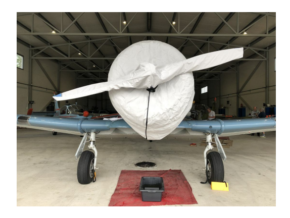
North American T6 Prop & Engine Covers

This cover type is made from Silver Acrylic Sunbrella canvas and is 100% lined with a soft and smooth microfiber. Bruce's Custom Covers developed this material combination especially for aircraft protection. The outer material is medium weight and treated for water resistance, UV resistance and anti-static buildup. The inner lining is a very soft and smooth microfiber to prevent scratching. The material is very reflective, and tests show that the cabin interior temperature can be reduced to near-ambient temperature on the hottest of days. It is water, ice and snow repellent, yet breathable to allow moisture to escape from between the cover and the aircraft surface.