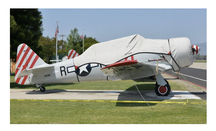
North American T6, SNJ, Harvard Canopy Cover With 48" Fwd Ext