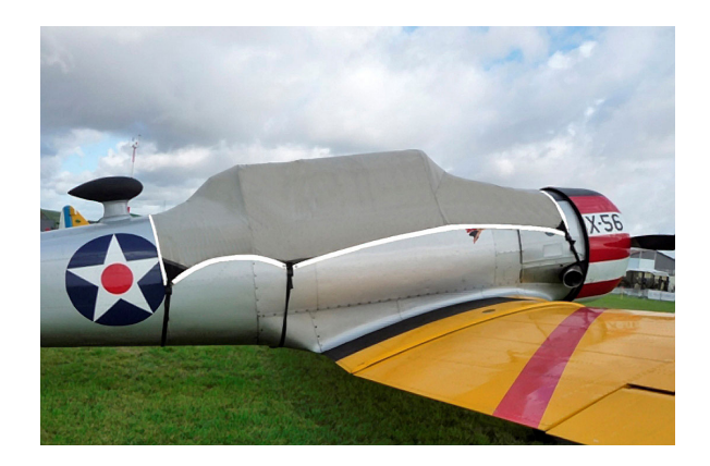
Canopy Cover with 40" forward extension

Travel Covers are made with Silver Solution-Dyed Polyester fabric and only lined over the windshield to save weight. The material is lightweight and more compact for easy stowage in the aircraft. The polyester material is water resistant, but only intended for occasional use outside. We also have an ultra lightweight material available for fitted hangar dust covers. For daily outdoor use, the non-travel Sunbrella Cover is the best choice.