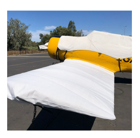
North American Harvard T6 Canopy, Prop & Wing Covers