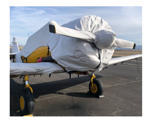
North American T6 Prop & Engine Covers

WINTER USE MATERIAL - Made with Solution-Dyed Polyester fabric, this option is intended for seasonal use to aid in deicing, rain mitigation, or for occasional travel. The material is lighter and more compact, but more susceptible to UV damage and may have a shorter useful life if used continuously outside than the all-year use material.