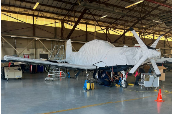
Beech T-6A Texan 2 Complete Hail Protection Cover Set

This cover type is made from Silver Acrylic Sunbrella canvas and is 100% lined with a soft and smooth microfiber. Bruce's Custom Covers developed this material combination especially for aircraft protection. The outer material is medium weight and treated for water resistance, UV resistance and anti-static buildup. The inner lining is a very soft and smooth microfiber to prevent scratching. The material is very reflective, and tests show that the cabin interior temperature can be reduced to near-ambient temperature on the hottest of days. It is water, ice and snow repellent, yet breathable to allow moisture to escape from between the cover and the aircraft surface.