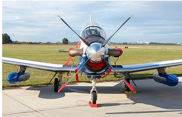
Texan II T6A Engine Inlet Plug, Prop Tie/Exhaust Covers

necessary. Engine plugs have warning flags that are visible from the cockpit or 'remove before flight' streamers sewn onto the face of the plugs. Most plugs are imprinted with the aircraft registration number in black for an extra charge. Storage bag NOT included. Engine plugs may be inserted after flight when the engine is still warm. Engine Inlet Plugs are commonly referred to as Cowl Plugs, Intake Plugs, Cowl Blocks, Engine Blocks, and Engine Bungs.