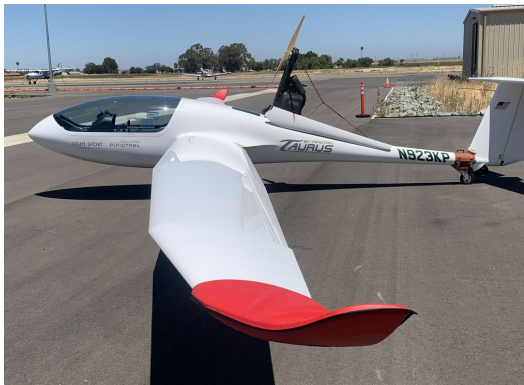
Pipistrel Taurus & Electro Wingtip Pads

Designed to prevent damage to the wingtip in crowded hangars or high traffic areas, these products are made of bright red Naugahyde and thickly padded with a sandwich of closed cell foam. Protects delicate winglets, casters and their housings, and soft finishes.