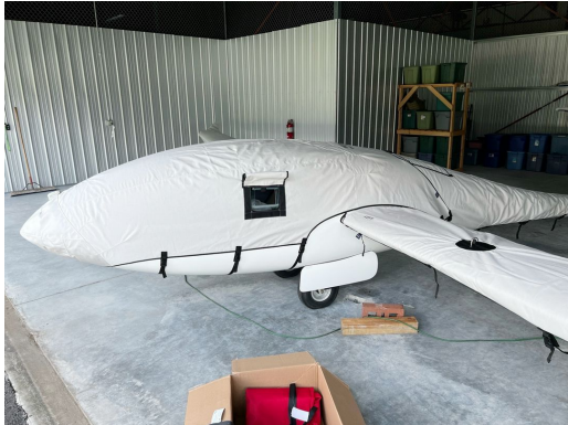
Pipistrel Taurus Complete Cover Set

WINTER USE MATERIAL - Made with Solution-Dyed Polyester fabric, this option is intended for seasonal use to aid in deicing, rain mitigation, or for occasional travel. The material is lighter and more compact, but more susceptible to UV damage and may have a shorter useful life if used continuously outside than the all-year use material.