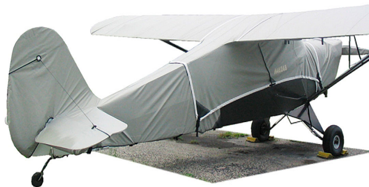
Taylorcraft L-2 Grasshopper Prop, Engine, Canopy, Wing and Empennage Covers