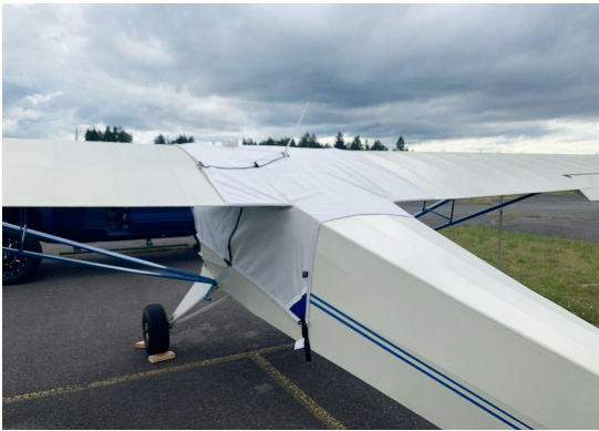
Taylorcraft Models F19 Over-The-Top Canopy Cover

This cover type is made from Silver Acrylic Sunbrella canvas and is 100% lined with a soft and smooth microfiber. Bruce's Custom Covers developed this material combination especially for aircraft protection. The outer material is medium weight and treated for water resistance, UV resistance and anti-static buildup. The inner lining is a very soft and smooth microfiber to prevent scratching. The material is very reflective, and tests show that the cabin interior temperature can be reduced to near-ambient temperature on the hottest of days. It is water, ice and snow repellent, yet breathable to allow moisture to escape from between the cover and the aircraft surface.