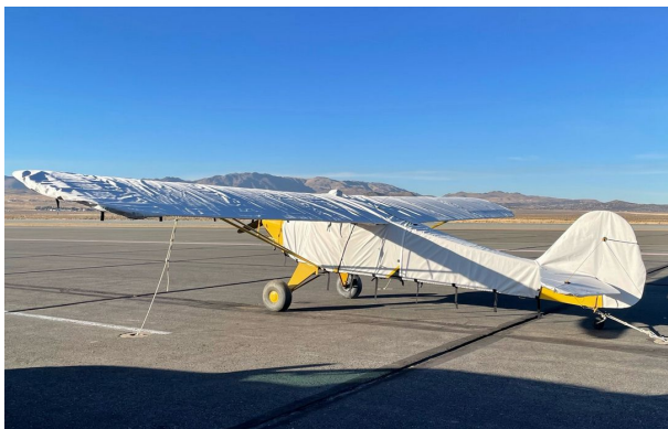
Taylorcraft BC-12D Extended Canopy, Wing & Empennage Covers

WINTER USE MATERIAL - Made with Solution-Dyed Polyester fabric, this option is intended for seasonal use to aid in deicing, rain mitigation, or for occasional travel. The material is lighter and more compact, but more susceptible to UV damage and may have a shorter useful life if used continuously outside than the all-year use material.