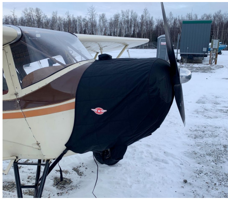
Taylorcraft Insulated Engine Cover

This cover type is made from Silver Acrylic Sunbrella canvas and is 100% lined with a soft and smooth microfiber. Bruce's Custom Covers developed this material combination especially for aircraft protection. The outer material is medium weight and treated for water resistance, UV resistance and anti-static buildup. The inner lining is a very soft and smooth microfiber to prevent scratching. The material is very reflective, and tests show that the cabin interior temperature can be reduced to near-ambient temperature on the hottest of days. It is water, ice and snow repellent, yet breathable to allow moisture to escape from between the cover and the aircraft surface.