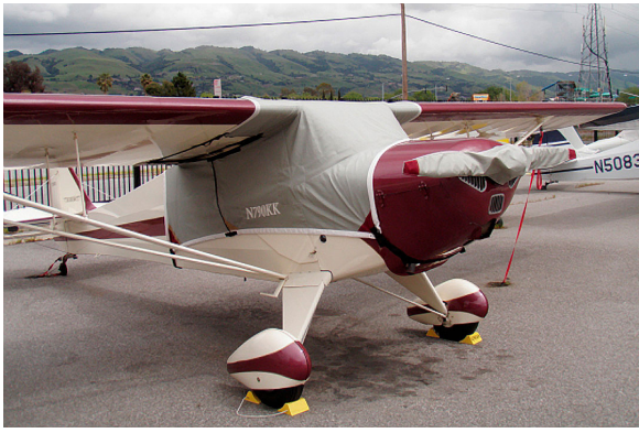
Taylorcraft Over-Top Canopy Cover