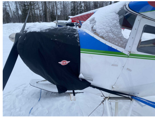
Taylorcraft Insulated Engine Cover