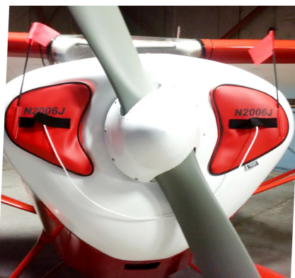
Taylorcraft Engine Inlet Plugs