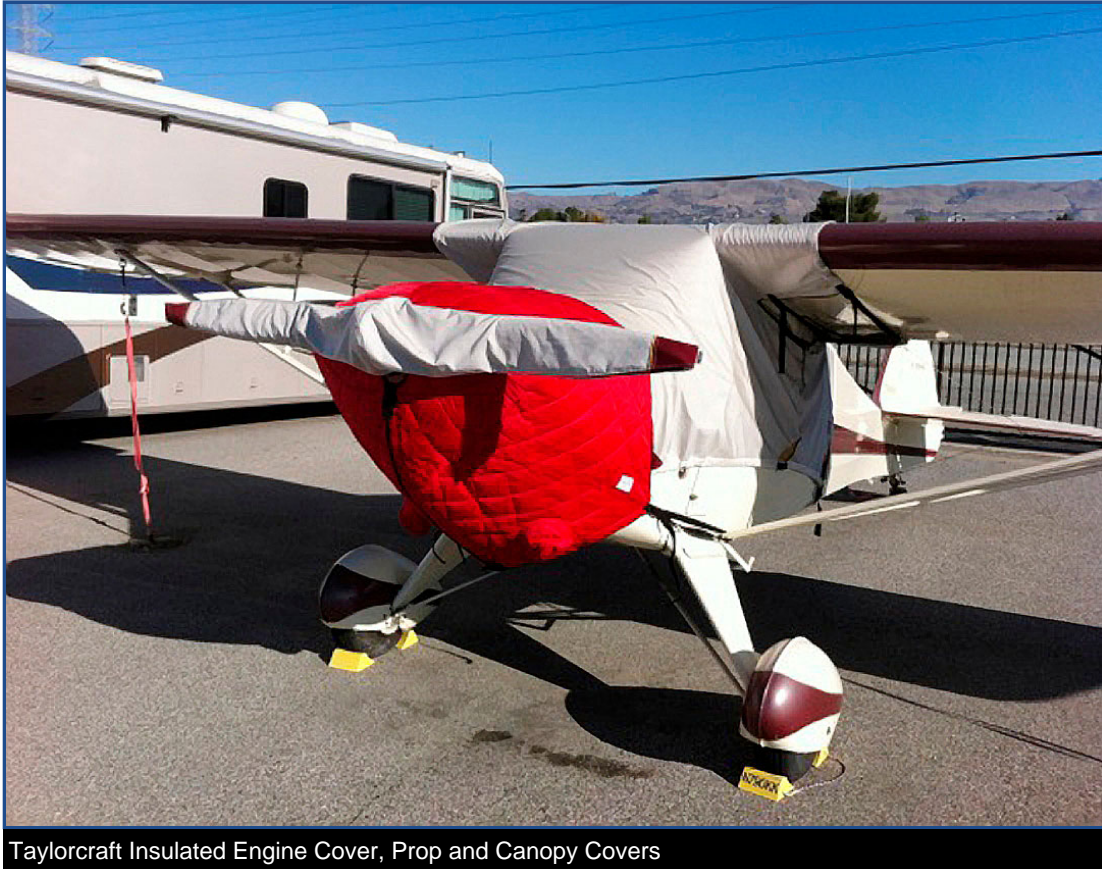
Taylorcraft Insulated Engine Cover, Prop and Canopy Covers