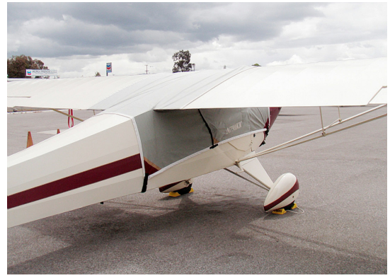
Taylorcraft Over-Top Canopy Cover