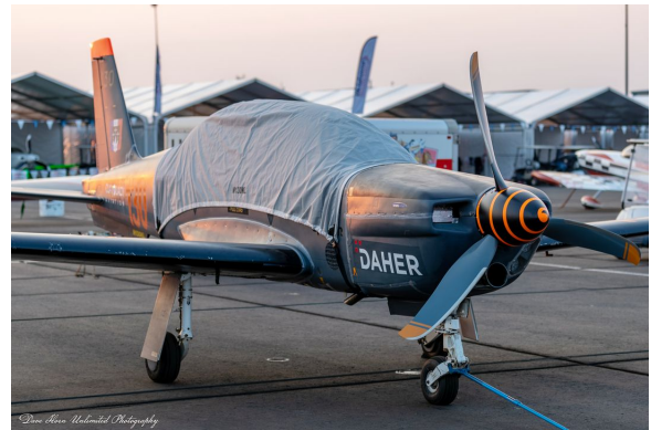
Socata TB-30 Epsilon Canopy Cover