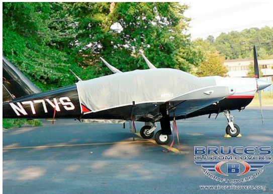
Socata TB20 Canopy Cover

Travel Covers are made with Silver Solution-Dyed Polyester fabric and only lined over the windshield to save weight. The material is lightweight and more compact for easy stowage in the aircraft. The polyester material is water resistant, but only intended for occasional use outside. We also have an ultra lightweight material available for fitted hangar dust covers. For daily outdoor use, the non-travel Sunbrella Cover is the best choice.