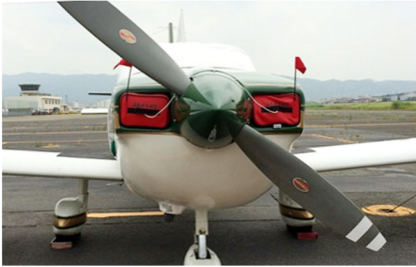
Socata TB-20 Engine Plugs