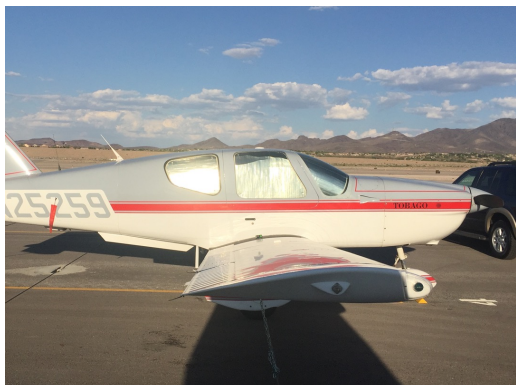
Socata TB-10 Cabin HeatShields

Windshield Heatshields are interior sunshades for an aircraft's front windshield. The product is a unique composite of closed-cell foam with a silver mylar finish. The semi-rigid design is stiff enough to stand along the inside of the windshield using sun visors or window framing. It folds up flat and easily stores in the included storage sleeve. Some designs may require velcro and suction cups or split right and left sides. A Heatshield is an excellent short-term remedy for cockpit overheating. An external fabric cover is far more effective and practical for long-term protection.