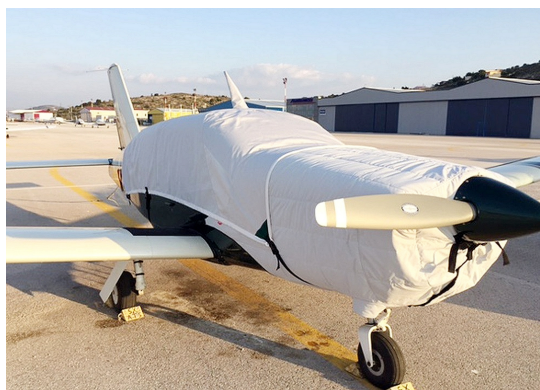
Socata TB-20 Canopy Cover, Insulated Engine Cover

This cover type is made from Silver Acrylic Sunbrella canvas and is 100% lined with a soft and smooth microfiber. Bruce's Custom Covers developed this material combination especially for aircraft protection. The outer material is medium weight and treated for water resistance, UV resistance and anti-static buildup. The inner lining is a very soft and smooth microfiber to prevent scratching. The material is very reflective, and tests show that the cabin interior temperature can be reduced to near-ambient temperature on the hottest of days. It is water, ice and snow repellent, yet breathable to allow moisture to escape from between the cover and the aircraft surface.