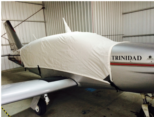
Trinidad Canopy Cover

Travel Covers are made with Silver Solution-Dyed Polyester fabric and only lined over the windshield to save weight. The material is lightweight and more compact for easy stowage in the aircraft. The polyester material is water resistant, but only intended for occasional use outside. We also have an ultra lightweight material available for fitted hangar dust covers. For daily outdoor use, the non-travel Sunbrella Cover is the best choice.