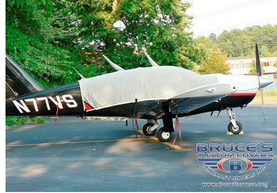
Socata TB20 Canopy Cover