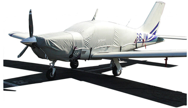
Canopy Cover & Engine Cover