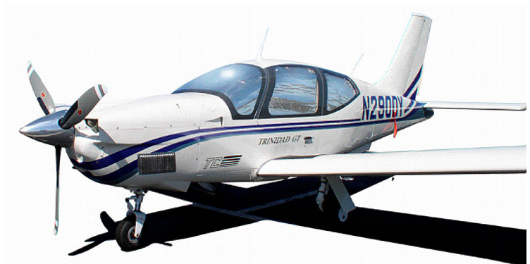
Socata TB20 HeatShields