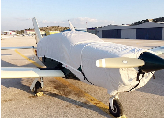
Socata TB-20 Canopy Cover, Insulated Engine Cover

This cover type is made from Silver Acrylic Sunbrella canvas and is 100% lined with a soft and smooth microfiber. Bruce's Custom Covers developed this material combination especially for aircraft protection. The outer material is medium weight and treated for water resistance, UV resistance and anti-static buildup. The inner lining is a very soft and smooth microfiber to prevent scratching. The material is very reflective, and tests show that the cabin interior temperature can be reduced to near-ambient temperature on the hottest of days. It is water, ice and snow repellent, yet breathable to allow moisture to escape from between the cover and the aircraft surface.