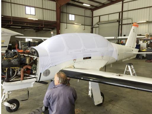
Socata TB30 Epsilon Canopy Cover, test fit cover

This cover type is made from Silver Acrylic Sunbrella canvas and is 100% lined with a soft and smooth microfiber. Bruce's Custom Covers developed this material combination especially for aircraft protection. The outer material is medium weight and treated for water resistance, UV resistance and anti-static buildup. The inner lining is a very soft and smooth microfiber to prevent scratching. The material is very reflective, and tests show that the cabin interior temperature can be reduced to near-ambient temperature on the hottest of days. It is water, ice and snow repellent, yet breathable to allow moisture to escape from between the cover and the aircraft surface.