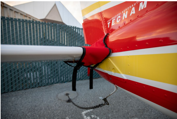
Tecnam Bravo Tailcone Cover

WINTER USE MATERIAL - Made with Solution-Dyed Polyester fabric, this option is intended for seasonal use to aid in deicing, rain mitigation, or for occasional travel. The material is lighter and more compact, but more susceptible to UV damage and may have a shorter useful life if used continuously outside than the all-year use material.