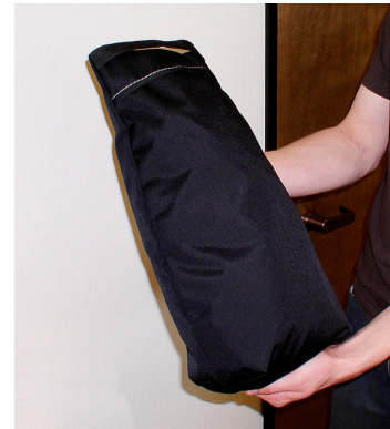
Light Weight Travel-Cover Mini-Storage Bag: 18" x 6" x 4"