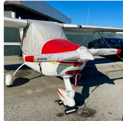
Tecnam Bravo Canopy & Prop Covers, Engine Plugs