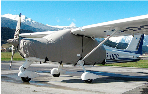
Tecnam Echo Extended Canopy, Engine, Prop Covers

This cover type is made from Silver Acrylic Sunbrella canvas and is 100% lined with a soft and smooth microfiber. Bruce's Custom Covers developed this material combination especially for aircraft protection. The outer material is medium weight and treated for water resistance, UV resistance and anti-static buildup. The inner lining is a very soft and smooth microfiber to prevent scratching. The material is very reflective, and tests show that the cabin interior temperature can be reduced to near-ambient temperature on the hottest of days. It is water, ice and snow repellent, yet breathable to allow moisture to escape from between the cover and the aircraft surface.