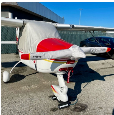
Tecnam Bravo Canopy & Prop Covers, Engine Plugs