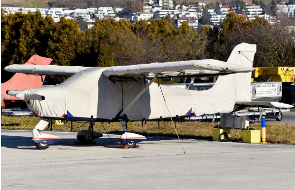
Tecnam P92 Echo Complete Cover Set

This cover type is made from Silver Acrylic Sunbrella canvas and is 100% lined with a soft and smooth microfiber. Bruce's Custom Covers developed this material combination especially for aircraft protection. The outer material is medium weight and treated for water resistance, UV resistance and anti-static buildup. The inner lining is a very soft and smooth microfiber to prevent scratching. The material is very reflective, and tests show that the cabin interior temperature can be reduced to near-ambient temperature on the hottest of days. It is water, ice and snow repellent, yet breathable to allow moisture to escape from between the cover and the aircraft surface.