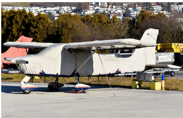
Tecnam P92 Echo Complete Cover Set

WINTER USE MATERIAL - Made with Solution-Dyed Polyester fabric, this option is intended for seasonal use to aid in deicing, rain mitigation, or for occasional travel. The material is lighter and more compact, but more susceptible to UV damage and may have a shorter useful life if used continuously outside than the all-year use material.