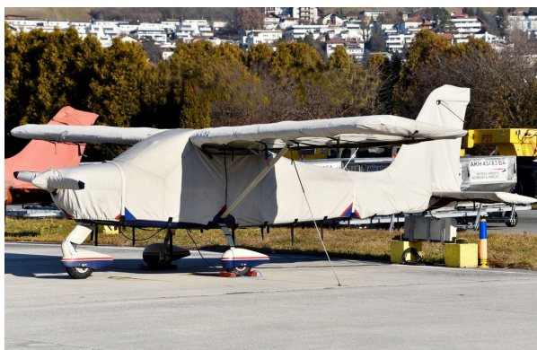
Tecnam P92 Echo Complete Cover Set