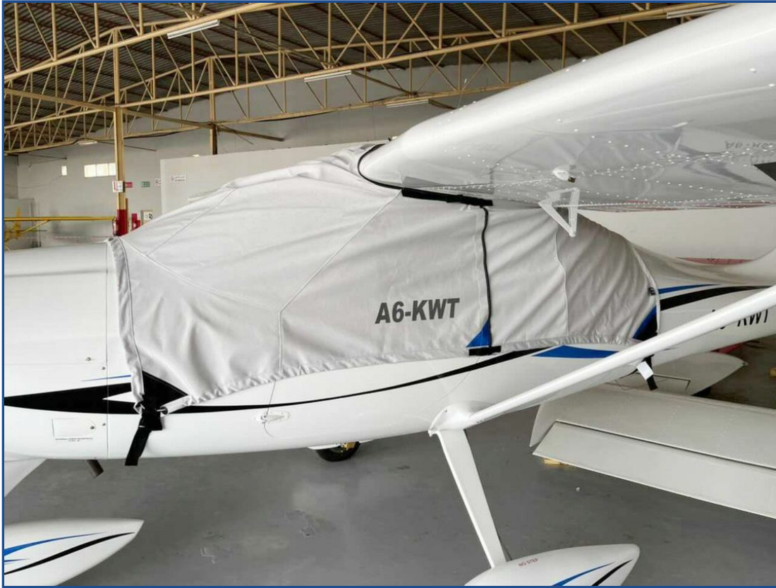
Tecnam P92 Echo Super Canopy Cover, Wrap-Around