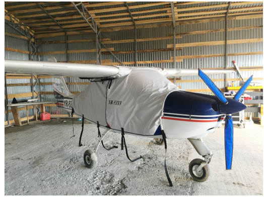
Tecnam P2004 Bravo Extended Canopy Cover, Over-Top Type