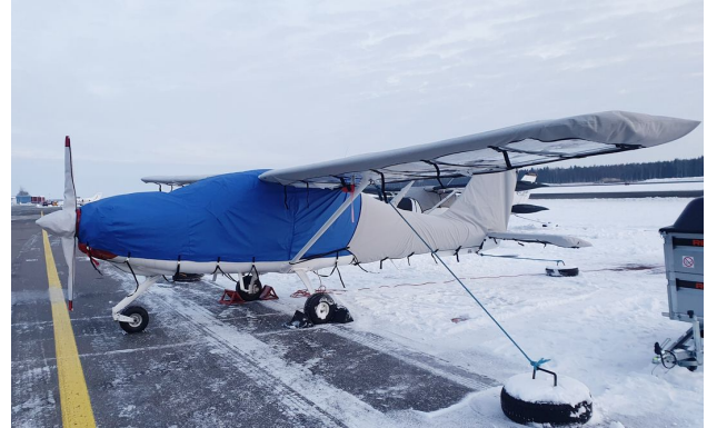
Tecnam P2010 Wing, Empennage & Prop Covers