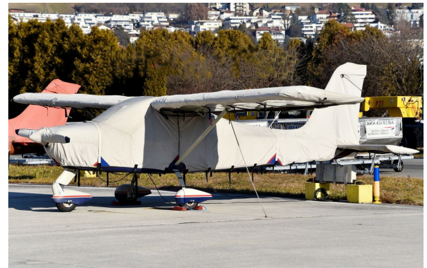
Tecnam P92 Echo Complete Cover Set