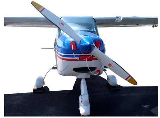
Tecnam Bravo Engine Plugs