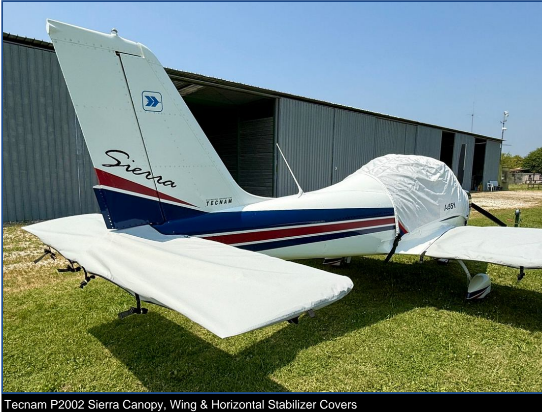
Tecnam P2002 Sierra Canopy, Wing &amp; Horizontal Stabilizer Covers