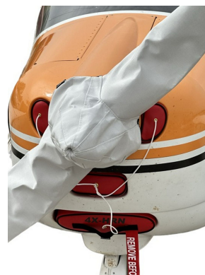
Tecnam P2002 Sierra Engine Plug Set