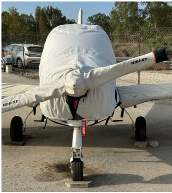
Tecnam Sierra Complete Cover Set

This cover type is made from Silver Acrylic Sunbrella canvas and is 100% lined with a soft and smooth microfiber. Bruce's Custom Covers developed this material combination especially for aircraft protection. The outer material is medium weight and treated for water resistance, UV resistance and anti-static buildup. The inner lining is a very soft and smooth microfiber to prevent scratching. The material is very reflective, and tests show that the cabin interior temperature can be reduced to near-ambient temperature on the hottest of days. It is water, ice and snow repellent, yet breathable to allow moisture to escape from between the cover and the aircraft surface.