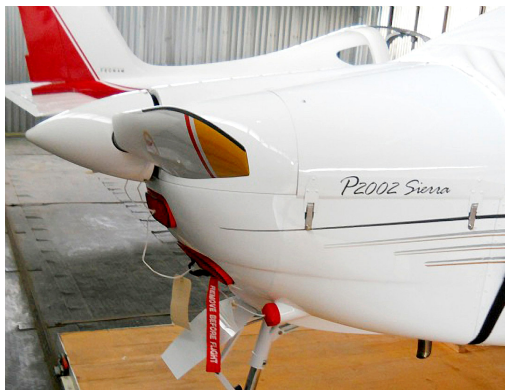
Tecnam Sierra Engine Inlet Plugs set

Engine Inlet Plugs are custom fit for your Tecnam P2002 Sierra, P96 Golf, P-Mentor intakes, made with heavy-duty vinyl material, and stuffed with a single block of sculpted urethane foam. Each plug has a zipper that allows the foam to be removed and dried if necessary. Engine plugs have warning flags that are visible from the cockpit or 'remove before flight' streamers sewn onto the face of the plugs. Most plugs are imprinted with the aircraft registration number in black for an extra charge. Storage bag NOT included. Engine plugs may be inserted after flight when the engine is still warm. Engine Inlet Plugs are commonly referred to as Cowl Plugs, Intake Plugs, Cowl Blocks, Engine Blocks, and Engine Bungs.