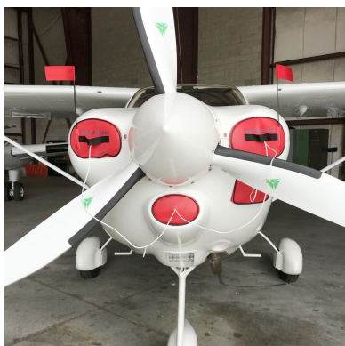
Tecnam P2010 Engine Plugs

Engine Inlet Plugs are custom fit for your Tecnam P2002 Sierra, P96 Golf, P-Mentor intakes, made with heavy-duty vinyl material, and stuffed with a single block of sculpted urethane foam. Each plug has a zipper that allows the foam to be removed and dried if necessary. Engine plugs have warning flags that are visible from the cockpit or 'remove before flight' streamers sewn onto the face of the plugs. Most plugs are imprinted with the aircraft registration number in black for an extra charge. Storage bag NOT included. Engine plugs may be inserted after flight when the engine is still warm. Engine Inlet Plugs are commonly referred to as Cowl Plugs, Intake Plugs, Cowl Blocks, Engine Blocks, and Engine Bunges.