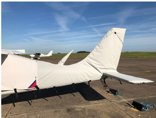
Tecnam P2008 Empennage Cover (Tailboom, Vertical & Horizontal Stabilizers), All Year Use

WINTER USE MATERIAL - Made with Solution-Dyed Polyester fabric, this option is intended for seasonal use to aid in deicing, rain mitigation, or for occasional travel. The material is lighter and more compact, but more susceptible to UV damage and may have a shorter useful life if used continuously outside than the all-year use material.