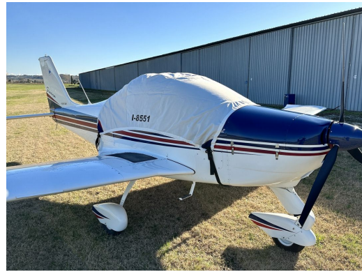
Tecnam P2002 Sierra Canopy Cover