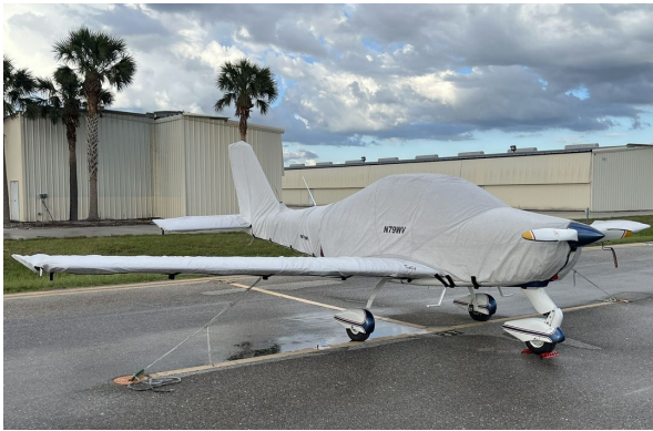
Tecnam P2002 Sierra Complete Cover Set

WINTER USE MATERIAL - Made with Solution-Dyed Polyester fabric, this option is intended for seasonal use to aid in deicing, rain mitigation, or for occasional travel. The material is lighter and more compact, but more susceptible to UV damage and may have a shorter useful life if used continuously outside than the all-year use material.