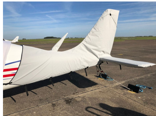
Tecnam P2008 Empennage Cover (Tailboom, Vertical & Horizontal Stabilizers), All Year Use