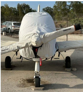
Tecnam Sierra Complete Cover Set

This cover type is made from Silver Acrylic Sunbrella canvas and is 100% lined with a soft and smooth microfiber. Bruce's Custom Covers developed this material combination especially for aircraft protection. The outer material is medium weight and treated for water resistance, UV resistance and anti-static buildup. The inner lining is a very soft and smooth microfiber to prevent scratching. The material is very reflective, and tests show that the cabin interior temperature can be reduced to near-ambient temperature on the hottest of days. It is water, ice and snow repellent, yet breathable to allow moisture to escape from between the cover and the aircraft surface.