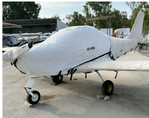
Tecnam Sierra Complete Cover Set