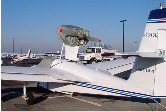
Lake Canopy & Engine Covers