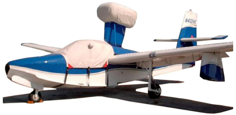
Lake Canopy & Engine Covers