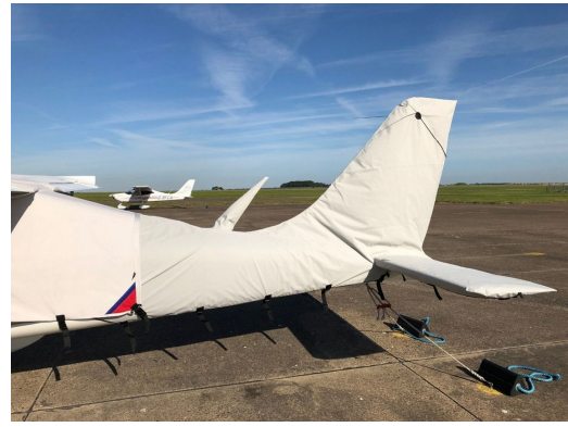
Tecnam P2008 Empennage Cover (Tailboom, Vertical & Horiz Stabilizers), All Year Use