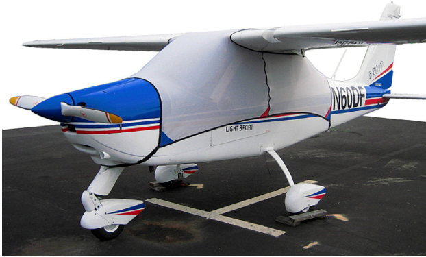
Tecnam Bravo Spandex FlyAway Travel Canopy Cover

The material is very reflective, and tests show that the cabin interior temperature can be reduced to near-ambient temperature on the hottest of days. It is water, ice and snow repellent, yet breathable to allow moisture to escape from between the cover and the aircraft surface.