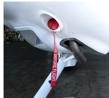
Tecnam Engine Plugs, set of 5