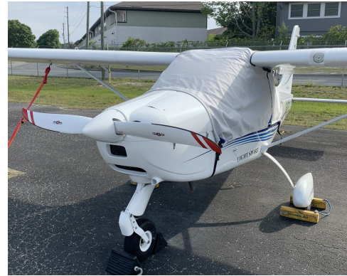
Tecnam P92 EAGLET Canopy Cover Over the Top Style