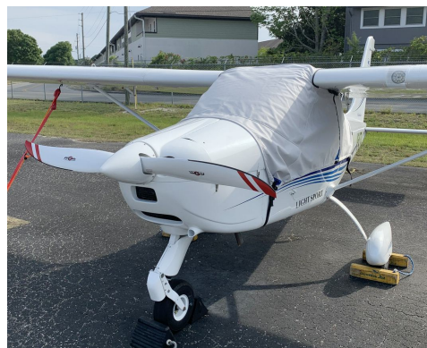
Tecnam P92 EAGLET Canopy Cover Over theTop Style