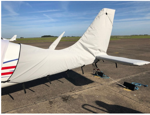
Tecnam P2008 Empennage Cover (Tailboom, Vertical & Horiz Stabilizers), All Year Use