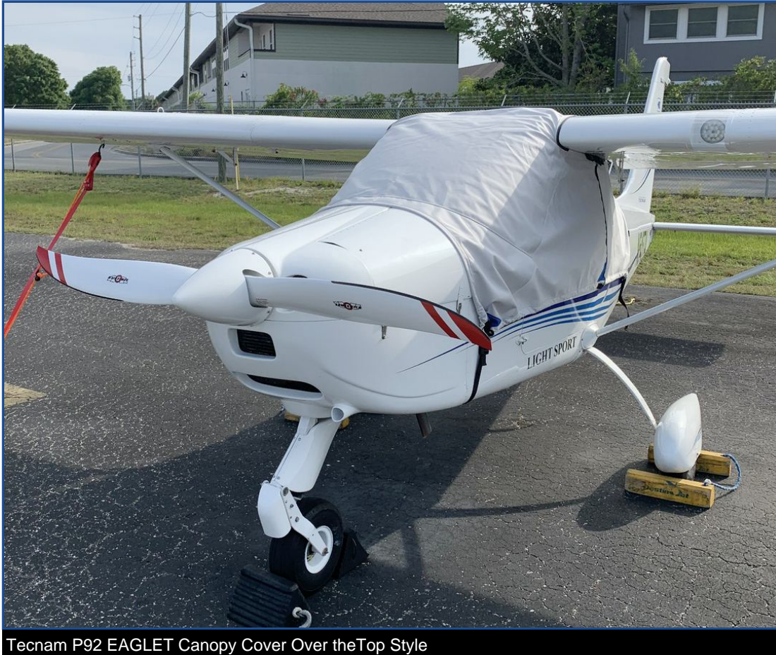
Tecnam P92 EAGLET Canopy Cover Over the Top Style