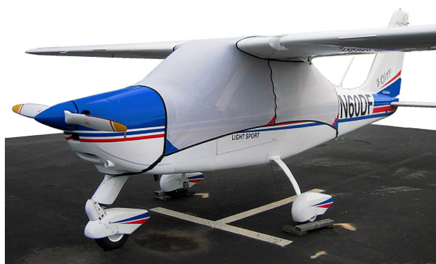
Tecnam Bravo Spandex FlyAway Travel Canopy Cover

Travel Covers are made with Silver Solution-Dyed Polyester fabric and only lined over the windshield to save weight. The material is lightweight and more compact for easy stowage in the aircraft. The polyester material is water resistant, but only intended for occasional use outside. We also have an ultra lightweight material available for fitted hangar dust covers. For daily outdoor use, the non-travel Sunbrella Cover is the best choice.