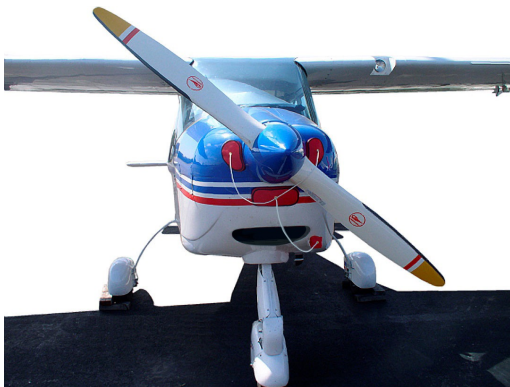
Tecnam Bravo Engine Plugs

Engine Inlet Plugs are custom fit for your Tecnam P92 Eaglet intakes, made with heavy-duty vinyl material, and stuffed with a single block of sculpted urethane foam. Each plug has a zipper that allows the foam to be removed and dried if necessary. Engine plugs have warning flags that are visible from the cockpit or 'remove before flight' streamers sewn onto the face of the plugs. Most plugs are imprinted with the aircraft registration number in black for an extra charge. Storage bag NOT included. Engine plugs may be inserted after flight when the engine is still warm. Engine Inlet Plugs are commonly referred to as Cowl Plugs, Intake Plugs, Cowl Blocks, Engine Blocks, and Engine Bungs.