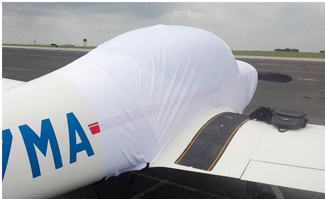
Taifun 17E Canopy/Engine Cover, test fit cover