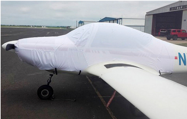
Taifun 17E Canopy/Engine Cover, test fit cover