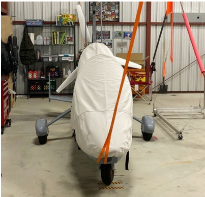
Magni Auto Gyro M16 Cockpit/Nose Cover

Travel Covers are made with Silver Solution-Dyed Polyester fabric and fully lined over the entire cover. The material is lightweight and more compact for easy stowage in the aircraft. The polyester material is water resistant, but only intended for occasional use outside. We also have an ultra lightweight material available for fitted hangar dust covers. For daily outdoor use, the non-travel Sunbrella Cover is the best choice.