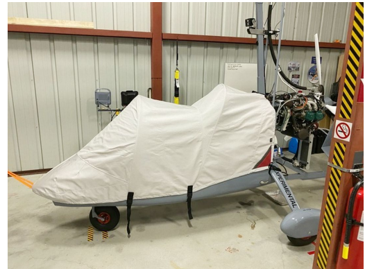
Magni Auto Gyro M16 Cockpit/Nose Cover