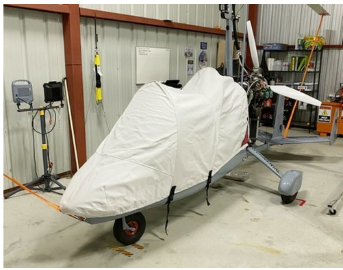
Magni Auto Gyro M16 Cockpit/Nose Cover