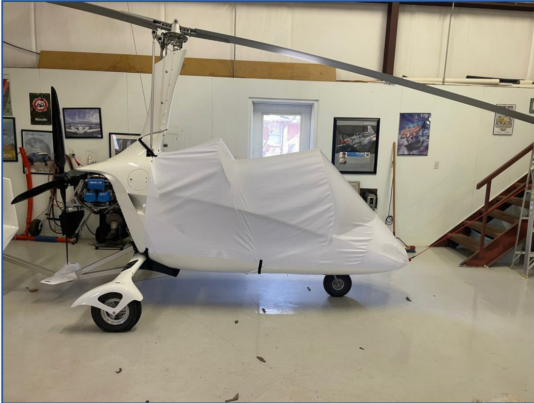
MTO Sport Gyrocopter Canopy/Nose Cover, test fit cover