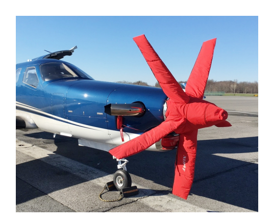
Socata TBM Insulated 5-Blade Prop/Spinner Cover