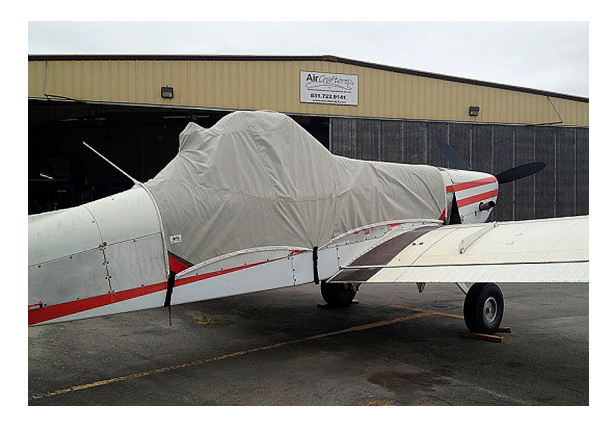
Piper Brave PA-36 Canopy/Hopper Cover