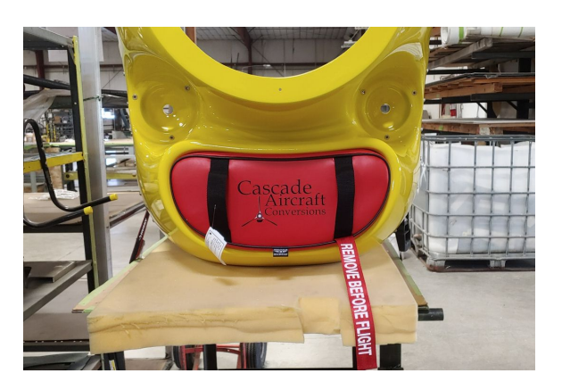
Thrush Intake Plug (Cascade Conversion)