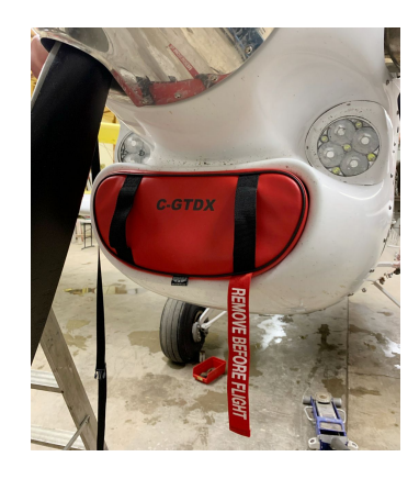
Ayres Thrush Intake Plug (Cascade Conversion)

Engine Inlet Plugs are custom fit for your Ayres Thrush intakes, made with heavy-duty vinyl material, and stuffed with a single block of sculpted urethane foam. Each plug has a zipper that allows the foam to be removed and dried if necessary. Engine plugs have warning flags that are visible from the cockpit or 'remove before flight' streamers sewn onto the face of the plugs. Most plugs are imprinted with the aircraft registration number in black for an extra charge. Storage bag NOT included. Engine plugs may be inserted after flight when the engine is still warm. Engine Inlet Plugs are commonly referred to as Cowl Plugs, Intake Plugs, Cowl Blocks, Engine Blocks, and Engine Bungs.