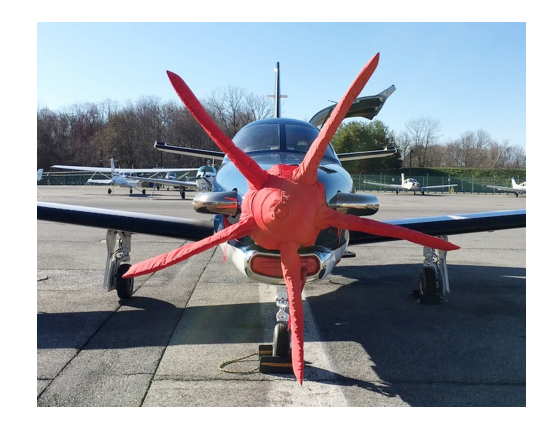
Socata TBM Insulated 5-Blade Prop/Spinner Cover

This cover type is made from Silver Acrylic Sunbrella canvas and is 100% lined with a soft and smooth microfiber. Bruce's Custom Covers developed this material combination especially for aircraft protection. The outer material is medium weight and treated for water resistance, UV resistance and anti-static buildup. The inner lining is a very soft and smooth microfiber to prevent scratching. The material is very reflective, and tests show that the cabin interior temperature can be reduced to near-ambient temperature on the hottest of days. It is water, ice and snow repellent, yet breathable to allow moisture to escape from between the cover and the aircraft surface.