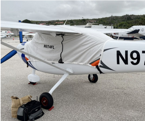
Orlican Eagle M-8 Canopy Cover

This cover type is made from Silver Acrylic Sunbrella canvas and is 100% lined with a soft and smooth microfiber. Bruce's Custom Covers developed this material combination especially for aircraft protection. The outer material is medium weight and treated for water resistance, UV resistance and anti-static buildup. The inner lining is a very soft and smooth microfiber to prevent scratching. The material is very reflective, and tests show that the cabin interior temperature can be reduced to near-ambient temperature on the hottest of days. It is water, ice and snow repellent, yet breathable to allow moisture to escape from between the cover and the aircraft surface.