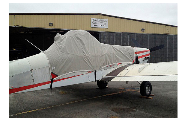
Piper Brave PA-36 Canopy/Hopper Cover

This cover type is made from Silver Acrylic Sunbrella canvas and is 100% lined with a soft and smooth microfiber. Bruce's Custom Covers developed this material combination especially for aircraft protection. The outer material is medium weight and treated for water resistance, UV resistance and anti-static buildup. The inner lining is a very soft and smooth microfiber to prevent scratching. The material is very reflective, and tests show that the cabin interior temperature can be reduced to near-ambient temperature on the hottest of days. It is water, ice and snow repellent, yet breathable to allow moisture to escape from between the cover and the aircraft surface.