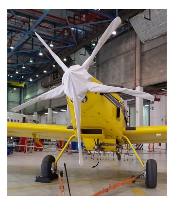
Air Tractor 5-Blade Prop Cover

This cover type is made from Silver Acrylic Sunbrella canvas and is 100% lined with a soft and smooth microfiber. Bruce's Custom Covers developed this material combination especially for aircraft protection. The outer material is medium weight and treated for water resistance, UV resistance and anti-static buildup. The inner lining is a very soft and smooth microfiber to prevent scratching. The material is very reflective, and tests show that the cabin interior temperature can be reduced to near-ambient temperature on the hottest of days. It is water, ice and snow repellent, yet breathable to allow moisture to escape from between the cover and the aircraft surface.