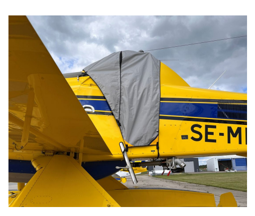
Air Tractor Light Weight Canopy Cover