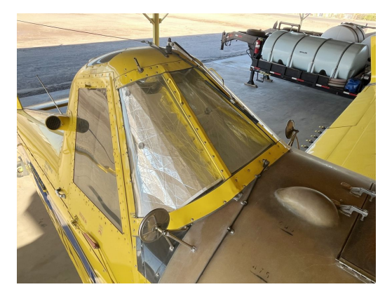
Air Tractor Cockpit HeatShields

foam with a silver mylar finish. The semi-rigid design is stiff enough to stand along the inside of the windshield using sun visors or window framing. It folds up flat and easily stores in the included storage sleeve. Some designs may require velcro and suction cups or split right and left sides. A Heatshield is an excellent short-term remedy for cockpit overheating. An external fabric cover is far more effective and practical for long-term protection.