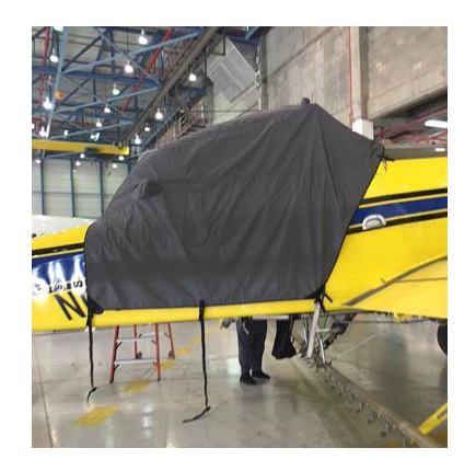
Air Tractor AT-802F Canopy Cover

Travel Covers are made with Silver Solution-Dyed Polyester fabric and only lined over the windshield to save weight. The material is lightweight and more compact for easy stowage in the aircraft. The polyester material is water resistant, but only intended for occasional use outside. We also have an ultra lightweight material available for fitted hangar dust covers. For daily outdoor use, the non-travel Sunbrella Cover is the best choice.