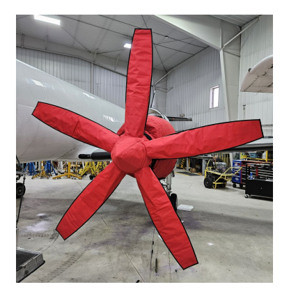
Fairchild Metro 5 Blade Insulated Insulated Prop Covers