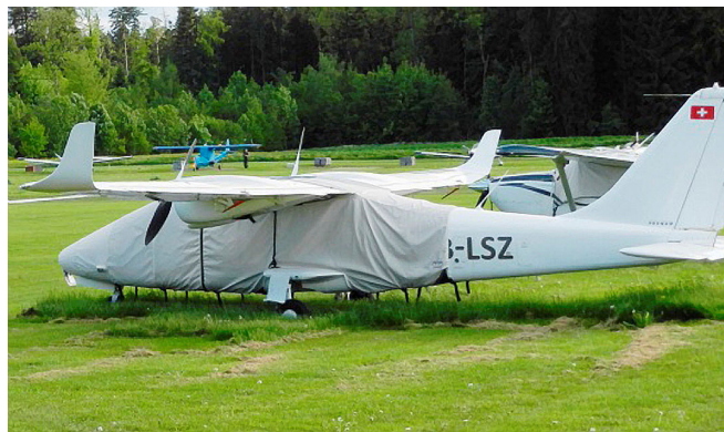
Tecnam Twin Extended Canopy/Nose Cover