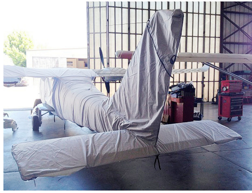
Tecnam Twin Canopy/Nose, Empennage, Wing/Engine, & Propellor/Spinner Covers