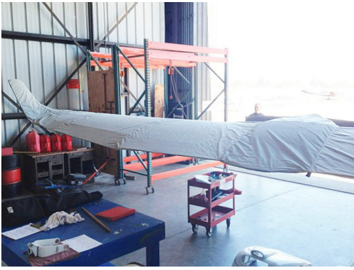
Tecnam Twin Wing/Engine Covers