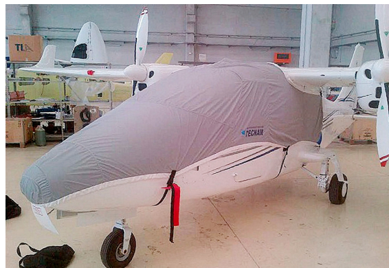
Tecnam P2006T Twin Lightweight Travel Canopy/Nose Cover

Travel Covers are made with Silver Solution-Dyed Polyester fabric and only lined over the windshield to save weight. The material is lightweight and more compact for easy stowage in the aircraft. The polyester material is water resistant, but only intended for occasional use outside. We also have an ultra lightweight material available for fitted hangar dust covers. For daily outdoor use, the non-travel Sunbrella Cover is the best choice.