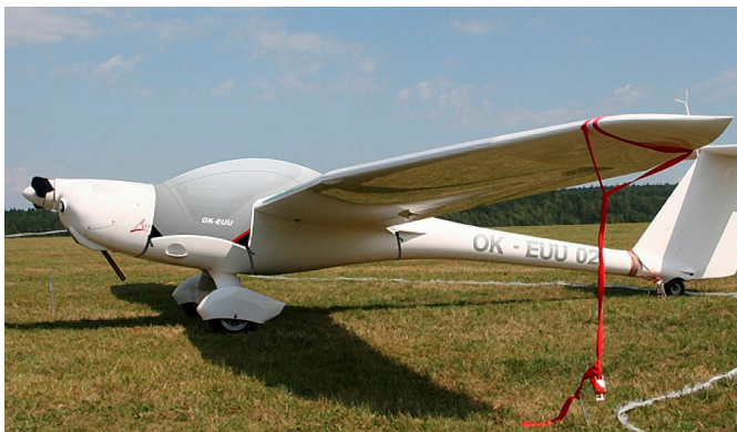
Lambda Canopy Cover (illustration)