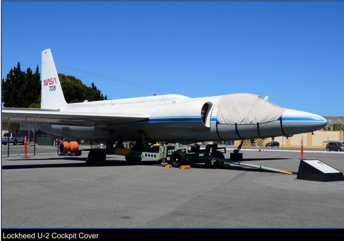
Lockheed U-2 Cockpit Cover