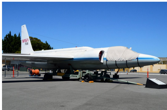
Lockheed U-2 Cockpit Cover