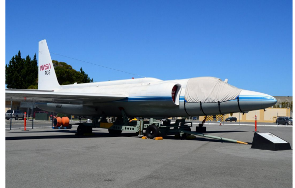
Lockheed U-2 Cockpit Cover