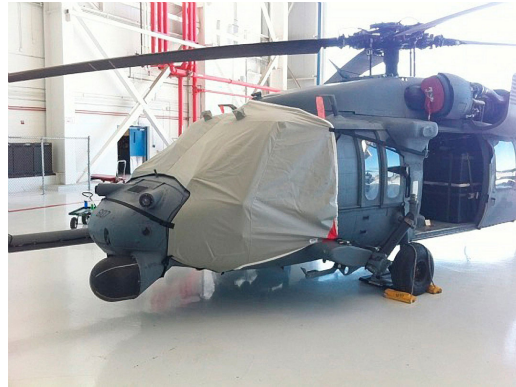
Windshield/Cockpit Chin Bubble Cover (Can be padded or unpadded)