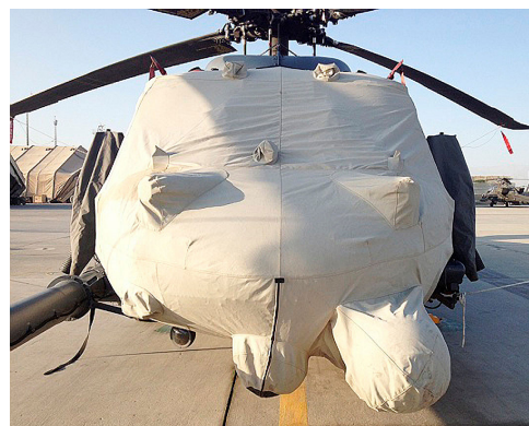
UH-60 Cockpit/Nose Cover