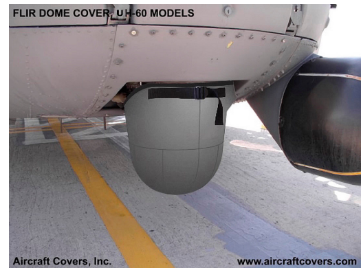
UH-60 FLIR DOME COVER (Army) MH-60L