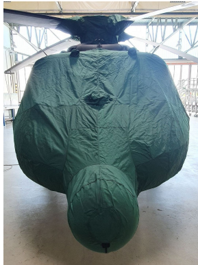
Sikorsky UH60 Cockpit/Nose Cover

This cover type is made from Silver Acrylic Sunbrella canvas and is 100% lined with a soft and smooth microfiber. Bruce's Custom Covers developed this material combination especially for aircraft protection. The outer material is medium weight and treated for water resistance, UV resistance and anti-static buildup. The inner lining is a very soft and smooth microfiber to prevent scratching. The material is very reflective, and tests show that the cabin interior temperature can be reduced to near-ambient temperature on the hottest of days. It is water, ice and snow repellent, yet breathable to allow moisture to escape from between the cover and the aircraft surface.