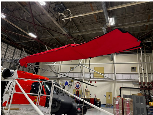
U.S. Coast Guard MH-60 Blade Covers

WINTER USE MATERIAL - Made with Solution-Dyed Polyester fabric, this option is intended for seasonal use to aid in deicing, rain mitigation, or for occasional travel. The material is lighter and more compact, but more susceptible to UV damage and may have a shorter useful life if used continuously outside than the all-year use material.