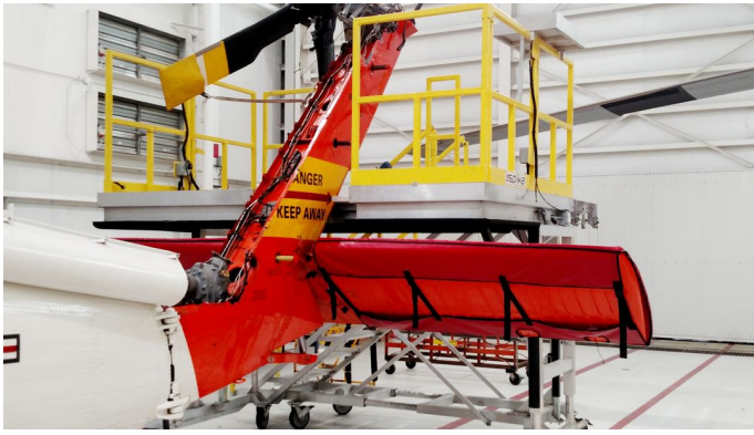
Sikorsky Blackhawk Horizontal Stabilizer Covers, Padded for maintenance protection