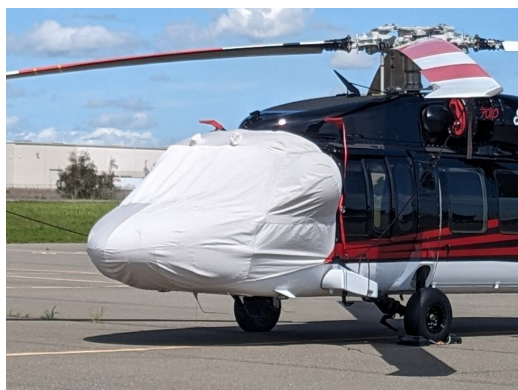
Sikorsky UH60 Windshield/Nose Cover

This cover type is made from Silver Acrylic Sunbrella canvas and is 100% lined with a soft and smooth microfiber. Bruce's Custom Covers developed this material combination especially for aircraft protection. The outer material is medium weight and treated for water resistance, UV resistance and anti-static buildup. The inner lining is a very soft and smooth microfiber to prevent scratching. The material is very reflective, and tests show that the cabin interior temperature can be reduced to near-ambient temperature on the hottest of days. It is water, ice and snow repellent, yet breathable to allow moisture to escape from between the cover and the aircraft surface.