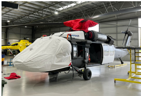
UH 60 Sierra Blackhawk Windshield/Nose Cover, Rotor Mast Cover