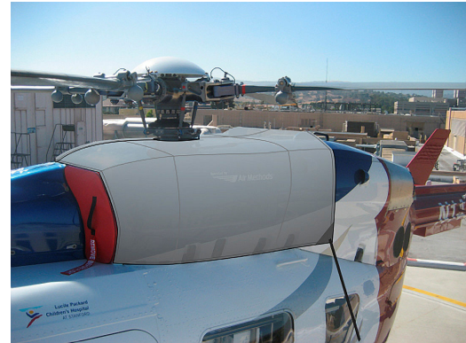
Bubble Cover w/ nose mounted radome, Upper Deck Plugs/Cover Upper Deck Plugs/Cover, extended to cover aft intake vents