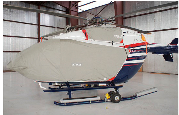
Eurocopter EC-145 Main Body Cover, also covers the bottom belly