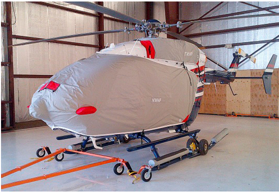
Bubble Cover w/ nose mounted radome & Upper Deck Plugs/Cover