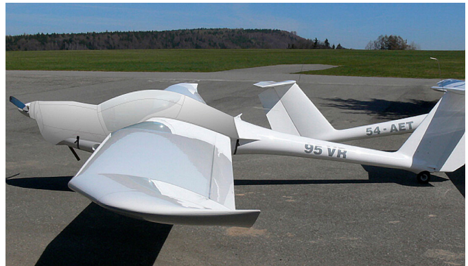
Lambda Canopy/Engine Cover (illustration)