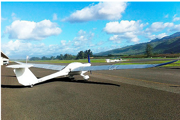
Lambda Canopy/Engine Cover and Wing Covers

WINTER USE MATERIAL - Made with Solution-Dyed Polyester fabric, this option is intended for seasonal use to aid in deicing, rain mitigation, or for occasional travel. The material is lighter and more compact, but more susceptible to UV damage and may have a shorter useful life if used continuously outside than the all-year use material.