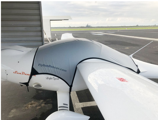
SUNDANCER Travel Cover with custom Imprint