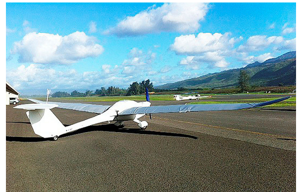
Grob 109 Canopy/Engine w/ extension to tail, Wing, Stabilizer & Prop/Spinner Covers Lambda Canopy/Engine Cover and Wing Covers