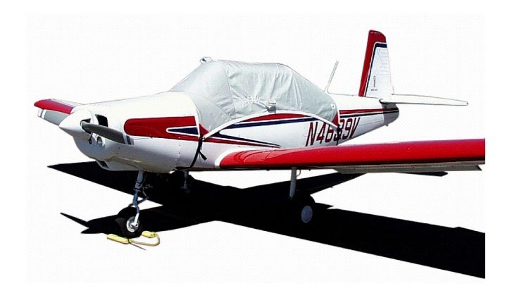
Canopy Cover for the Varga Kachina