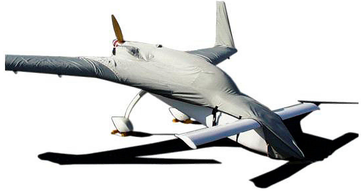
Long-EZ Canopy/Engine and Wing Covers