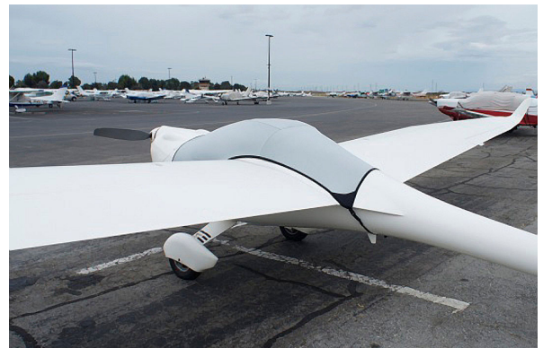
Lambada Canopy/Engine Cover and Wing Covers