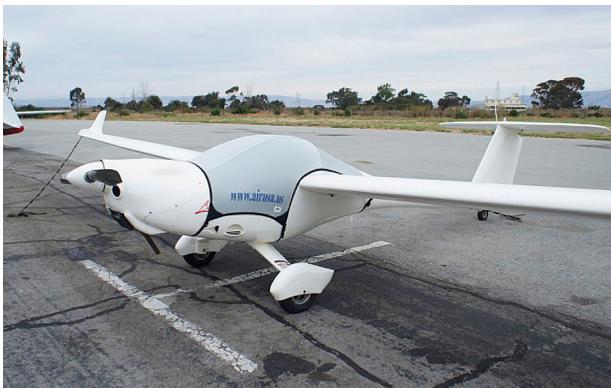
Lambada Canopy Cover