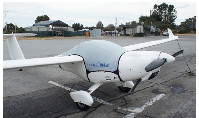
Lambda Travel Canopy Cover