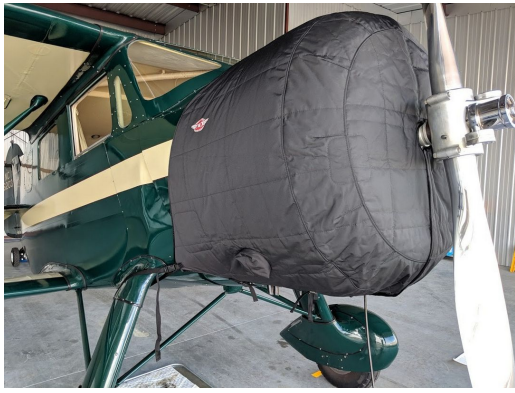
Wacon Cabin Biplane ZQC-6 Insulated Engine Cover