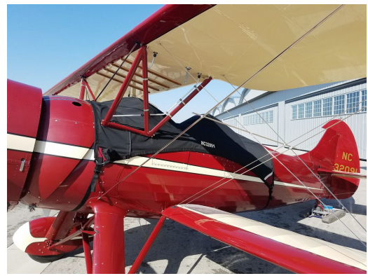
Waco UPF-7 Canopy Cover