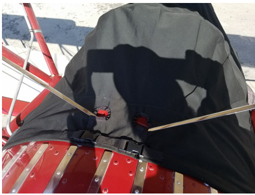
Waco UPF-7 Canopy Cover