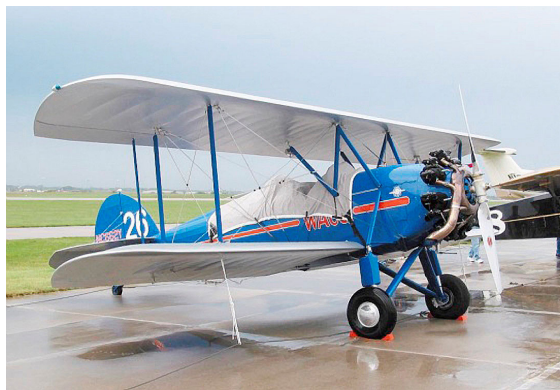
Waco ASO Canopy Cover