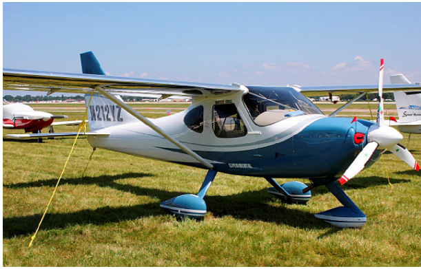
Glastar Sportsman Engine Inlet Plugs