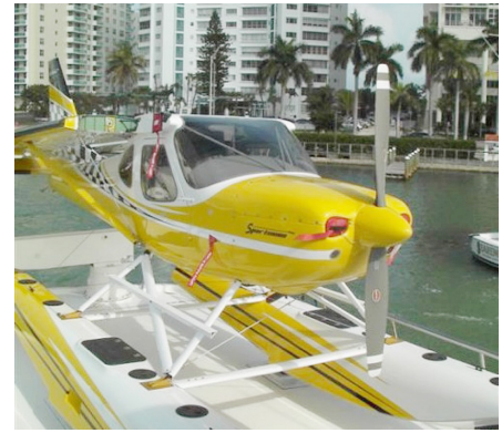
Glastar Engine Plugs