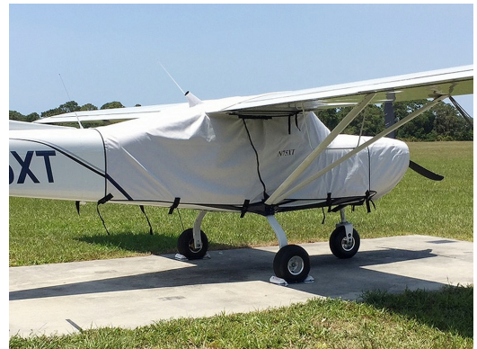
World Aircraft Extended Canopy Cover & Engine Cover