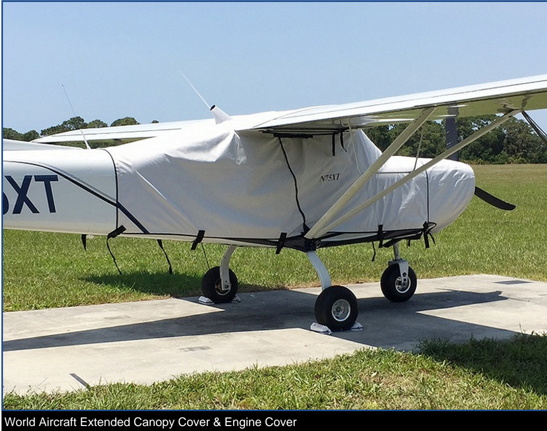
World Aircraft Extended Canopy Cover &amp; Engine Cover