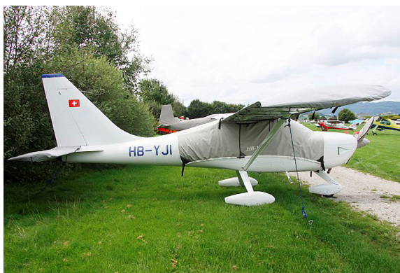
Glstar Canopy, Wings, Horizontal Stab. & Prop Covers