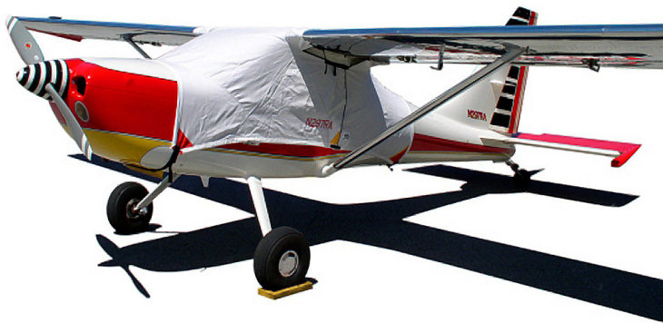
Glastar Over-Top Canopy Cover

This cover type is made from Silver Acrylic Sunbrella canvas and is 100% lined with a soft and smooth microfiber. Bruce's Custom Covers developed this material combination especially for aircraft protection. The outer material is medium weight and treated for water resistance, UV resistance and anti-static buildup. The inner lining is a very soft and smooth microfiber to prevent scratching. The material is very reflective, and tests show that the cabin interior temperature can be reduced to near-ambient temperature on the hottest of days. It is water, ice and snow repellent, yet breathable to allow moisture to escape from between the cover and the aircraft surface.