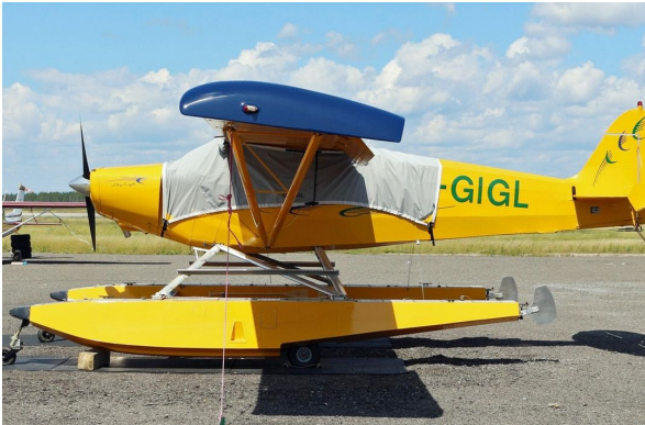
Wag Aero Sportsman 2+2 Canopy Cover

This cover type is made from Silver Acrylic Sunbrella canvas and is 100% lined with a soft and smooth microfiber. Bruce's Custom Covers developed this material combination especially for aircraft protection. The outer material is medium weight and treated for water resistance, UV resistance and anti-static buildup. The inner lining is a very soft and smooth microfiber to prevent scratching. The material is very reflective, and tests show that the cabin interior temperature can be reduced to near-ambient temperature on the hottest of days. It is water, ice and snow repellent, yet breathable to allow moisture to escape from between the cover and the aircraft surface.