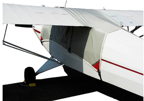
Piper PA-12 Super Cruiser Over-Top Canopy Cover