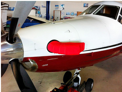
Pilatus PC-12 Exhaust Cover, Fully Enclosed, for protection against corrosion.

Prop Tie-Down/Exhaust Covers are made of heavy duty red vinyl material. Thick nylon webbing runs from the exhaust covers to the prop boot. This webbing is adjustable with plastic buckles, and is held tight with a steel spring where it attaches to the prop boot.