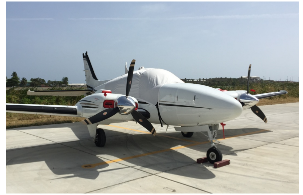
Baron 58 Canopy Cover, Engine Plugs