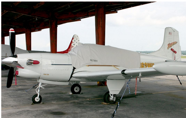
Beech Harpoon Canopy Cover, Exhaust Covers, Engine Plug

Prop Tie-Down/Exhaust Covers are made of heavy duty red vinyl material. Thick nylon webbing runs from the exhaust covers to the prop boot. This webbing is adjustable with plastic buckles, and is held tight with a steel spring where it attaches to the prop boot.