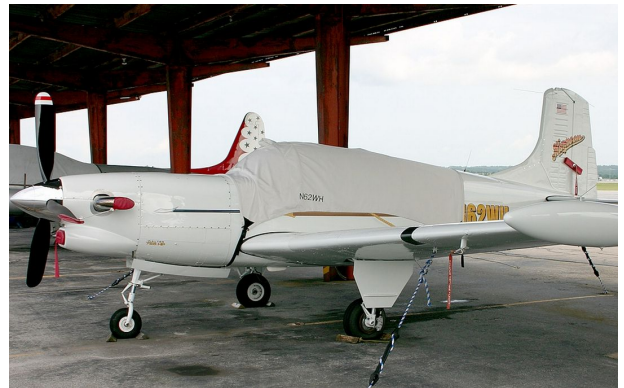
Beech Harpoon Canopy Cover, Exhaust Covers, Engine Plug