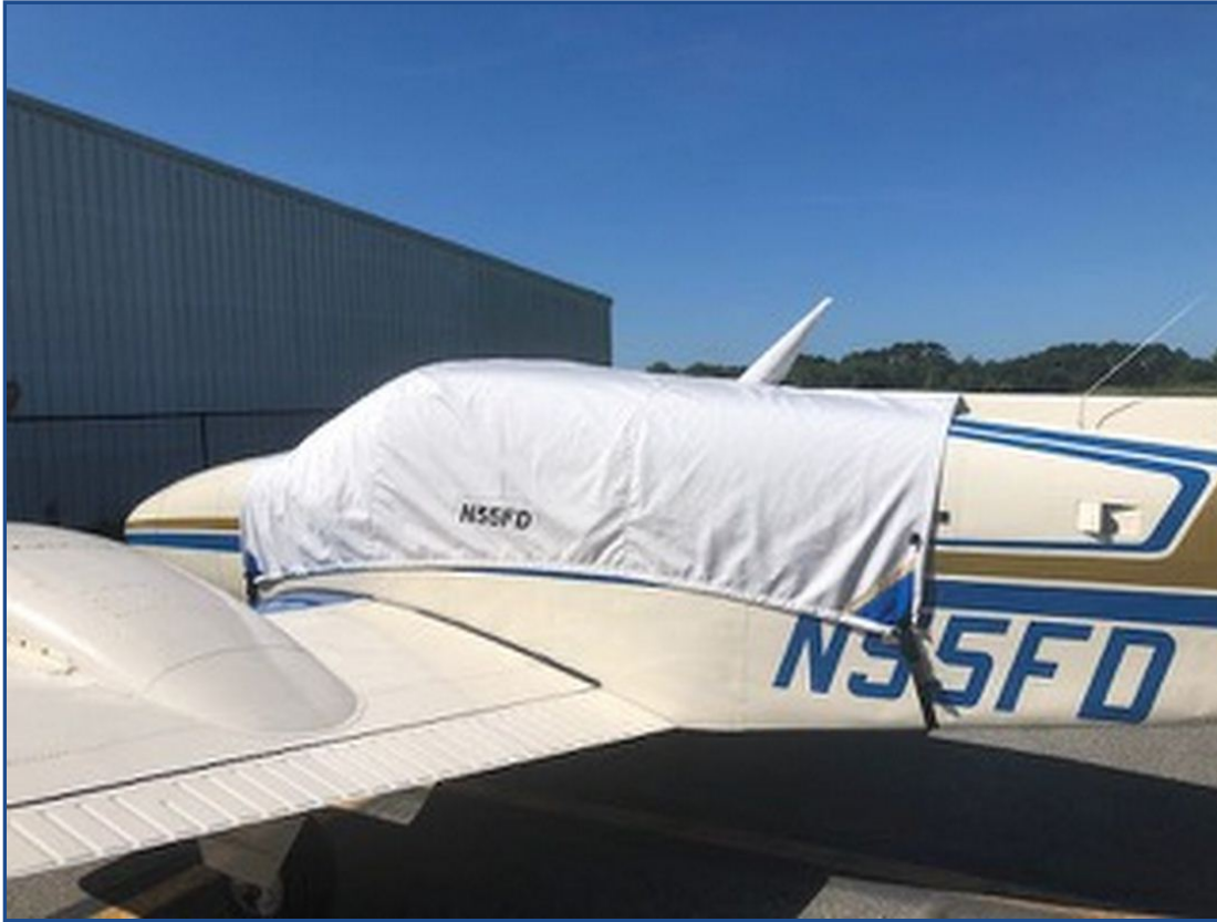
Beech Baron 95-B55 Canopy cover