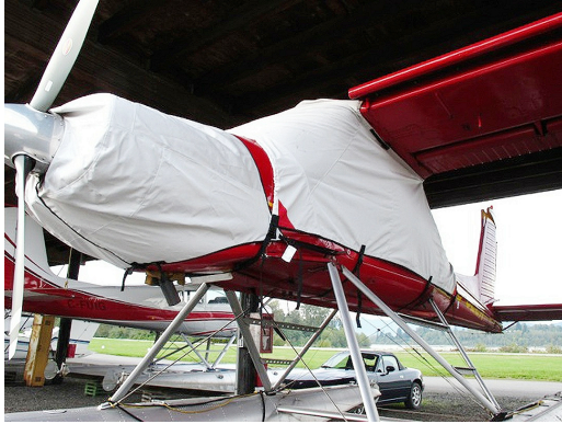
Wilga 2000 Canopy and Engine Covers

water resistance, UV resistance and anti-static buildup. The inner lining is a very soft and smooth microfiber to prevent scratching. The material is very reflective, and tests show that the cabin interior temperature can be reduced to near-ambient temperature on the hottest of days. It is water, ice and snow repellent, yet breathable to allow moisture to escape from between the cover and the aircraft surface.