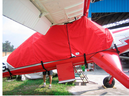
Wilga Canopy Cover