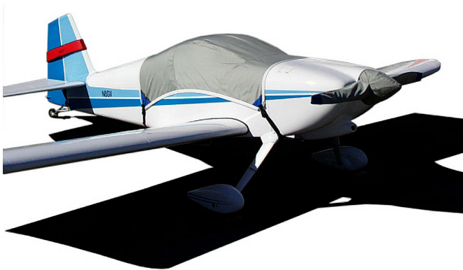
Canopy Cover, Prop Cover

This cover type is made from Silver Acrylic Sunbrella canvas and is 100% lined with a soft and smooth microfiber. Bruce's Custom Covers developed this material combination especially for aircraft protection. The outer material is medium weight and treated for water resistance, UV resistance and anti-static buildup. The inner lining is a very soft and smooth microfiber to prevent scratching. The material is very reflective, and tests show that the cabin interior temperature can be reduced to near-ambient temperature on the hottest of days. It is water, ice and snow repellent, yet breathable to allow moisture to escape from between the cover and the aircraft surface.