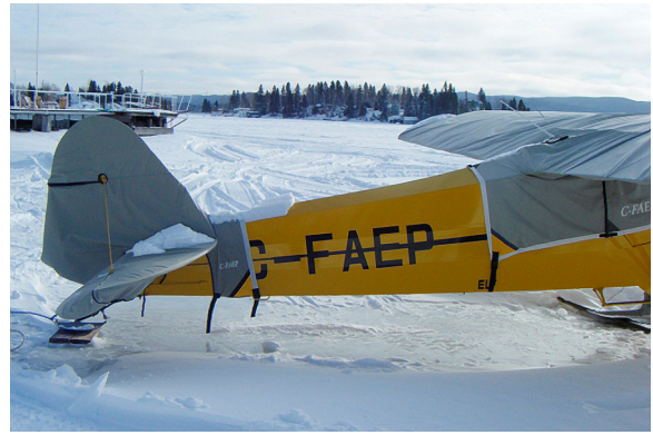
Piper J3 Cub Abbreviated Empennage Cover, Wing Covers and Canopy Cover