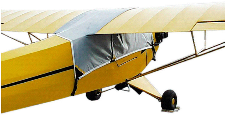
Piper J3 Over-Top Canopy Cover