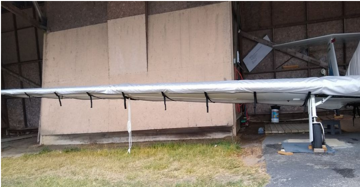
Aeromot Ximango Wing Covers

WINTER USE MATERIAL - Made with Solution-Dyed Polyester fabric, this option is intended for seasonal use to aid in deicing, rain mitigation, or for occasional travel. The material is lighter and more compact, but more susceptible to UV damage and may have a shorter useful life if used continuously outside than the all-year use material.