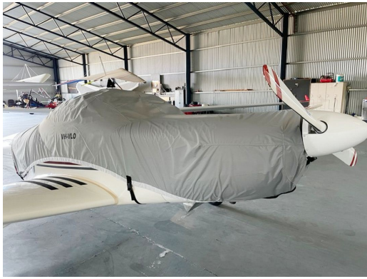
Ximango Travel Weight Canopy/Engine Cover