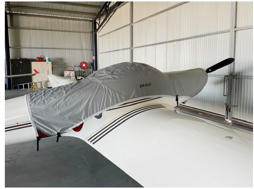
Ximango Travel Weight Canopy/Engine Cover