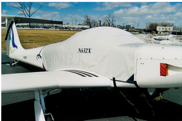
Ximango Extended Canopy Cover