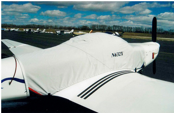
Ximango Extended Canopy Cover