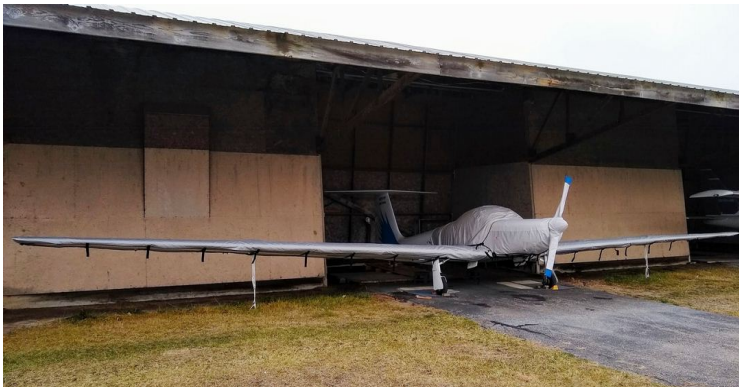
Aeromot Ximango Extended Canopy Cover, Engine, Prop & Wing Covers

WINTER USE MATERIAL - Made with Solution-Dyed Polyester fabric, this option is intended for seasonal use to aid in deicing, rain mitigation, or for occasional travel. The material is lighter and more compact, but more susceptible to UV damage and may have a shorter useful life if used continuously outside than the all-year use material.