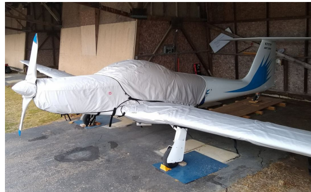
Aeromot Ximango Extended Canopy Cover, Engine, Prop & Wing Covers