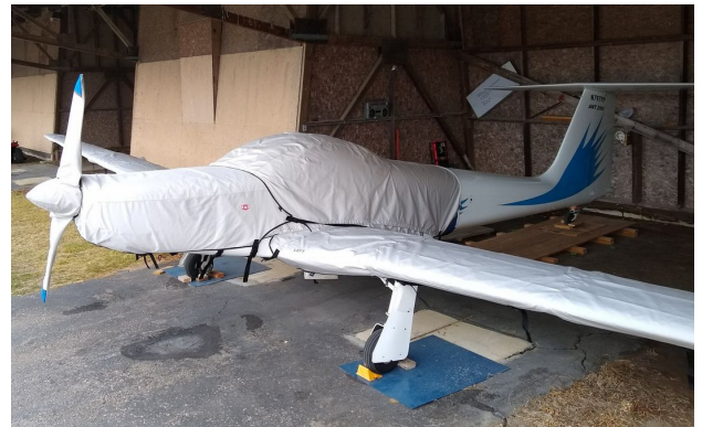
Aeromot Ximango Extended Canopy Cover, Engine, Prop & Wing Covers