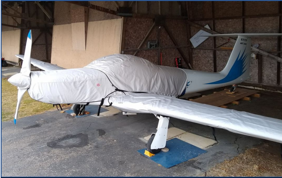
Aeromot Ximango Extended Canopy Cover, Engine, Prop & Wing Covers