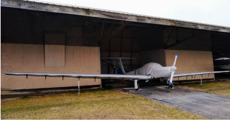
Aeromot Ximango Extended Canopy Cover, Engine, Prop & Wing Covers