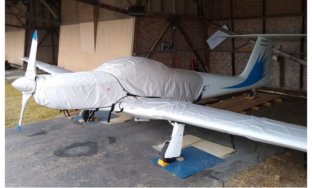
Aeromot Ximango Extended Canopy Cover, Engine, Prop & Wing Covers