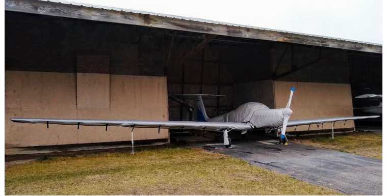
Aeromot Ximango Extended Canopy Cover, Engine, Prop & Wing Covers