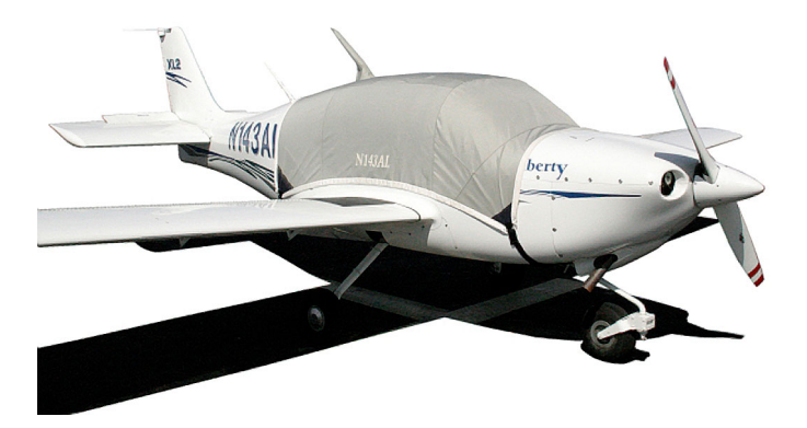
XL-2 Canopy Cover