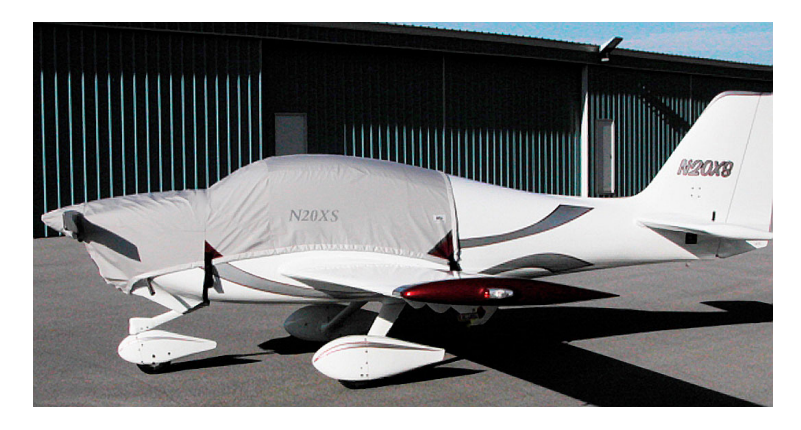
Canopy/Engine and Prop/Spinner Covers (tri-gear model)

Travel Covers are made with Silver Solution-Dyed Polyester fabric and only lined over the windshield to save weight. The material is lightweight and more compact for easy stowage in the aircraft. The polyester material is water resistant, but only intended for occasional use outside. We also have an ultra lightweight material available for fitted hangar dust covers. For daily outdoor use, the non-travel Sunbrella Cover is the best choice.