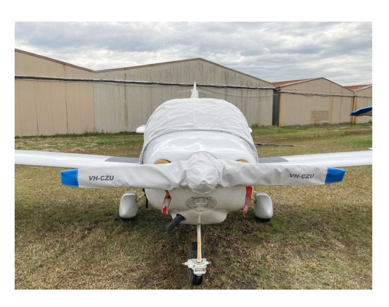
XL-2 PROPELLOR/SPINNER COVER