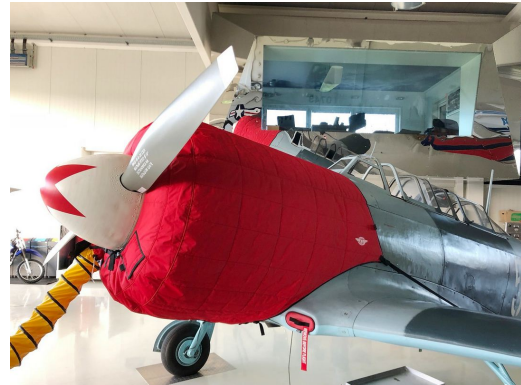
Yak 11 Insulated Engine Cover & Oil Cooler Inlet Plug