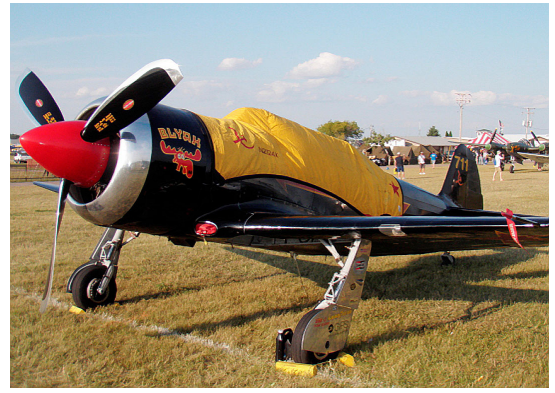
Yak 55 Full Fuselage Cover w/ Detachable Wing Covers & Propellor/Spinner Cover Yak 11 Canopy Cover, Plugs & Pitot Covers