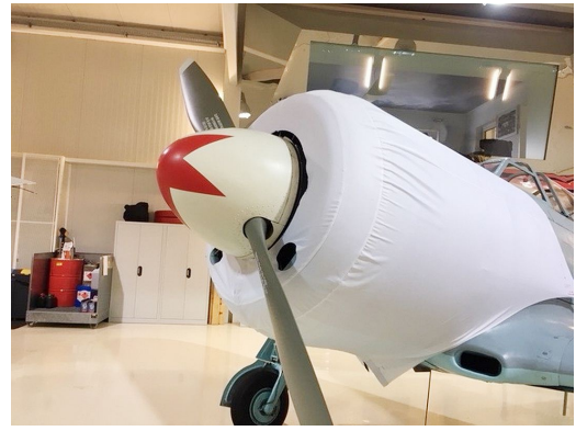
Yak 11 Engine Cover (test fit cover)