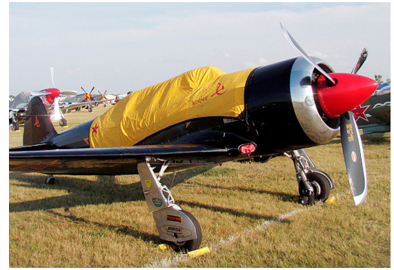
Yak 11 Canopy Cover, Plugs & Pitot Covers