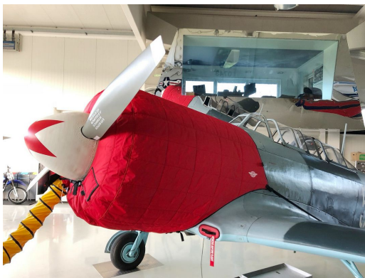
Yak 11 Insulated Engine Cover & Oil Cooler Inlet Plug

Engine Inlet Plugs are custom fit for your Yakovlev Yak 11 intakes, made with heavy-duty vinyl material, and stuffed with a single block of sculpted urethane foam. Each plug has a zipper that allows the foam to be removed and dried if necessary. Engine plugs have warning flags that are visible from the cockpit or 'remove before flight' streamers sewn onto the face of the plugs. Most plugs are imprinted with the aircraft registration number in black for an extra charge. Storage bag NOT included. Engine plugs may be inserted after flight when the engine is still warm. Engine Inlet Plugs are commonly referred to as Cowl Plugs, Intake Plugs, Cowl Blocks, Engine Blocks, and Engine Bungs.