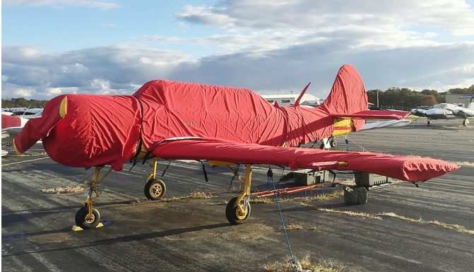
Yak 52 Full Cover Set

WINTER USE MATERIAL - Made with Solution-Dyed Polyester fabric, this option is intended for seasonal use to aid in deicing, rain mitigation, or for occasional travel. The material is lighter and more compact, but more susceptible to UV damage and may have a shorter useful life if used continuously outside than the all-year use material.