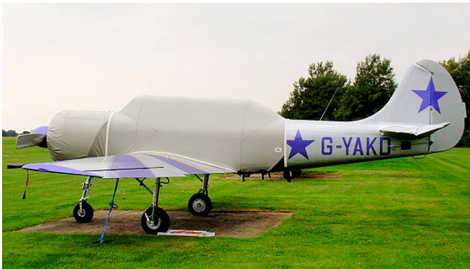
Yak 52 Extended Canopy, Engine & Horiz. Stab. Covers

This cover type is made from Silver Acrylic Sunbrella canvas and is 100% lined with a soft and smooth microfiber. Bruce's Custom Covers developed this material combination especially for aircraft protection. The outer material is medium weight and treated for water resistance, UV resistance and anti-static buildup. The inner lining is a very soft and smooth microfiber to prevent scratching. The material is very reflective, and tests show that the cabin interior temperature can be reduced to near-ambient temperature on the hottest of days. It is water, ice and snow repellent, yet breathable to allow moisture to escape from between the cover and the aircraft surface.