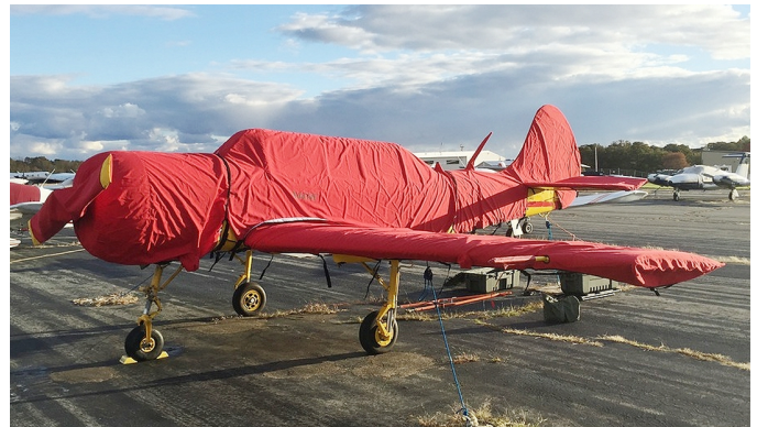
Yak 52 Full Cover Set