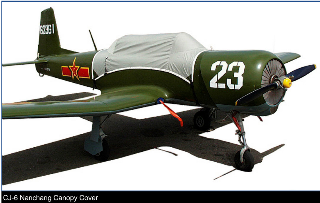
CJ-6 Nanchang Canopy Cover