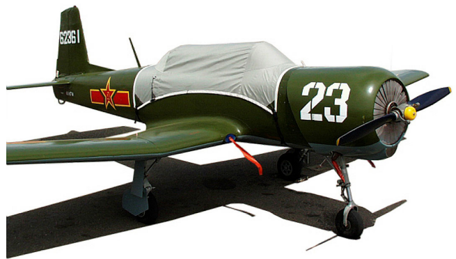
CJ-6 Nanchang Canopy Cover