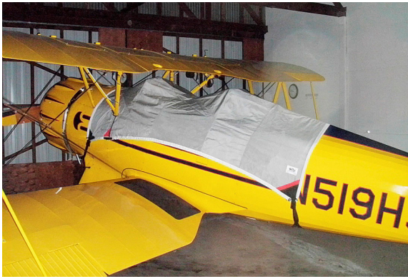
The Waco YMF Canopy Cover