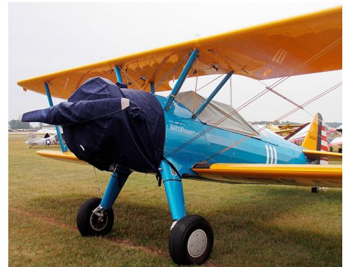
Stearman Canopy, Engine & Prop Covers