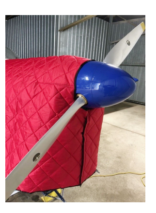
Zlin 142 Insulated Hangar Blanket