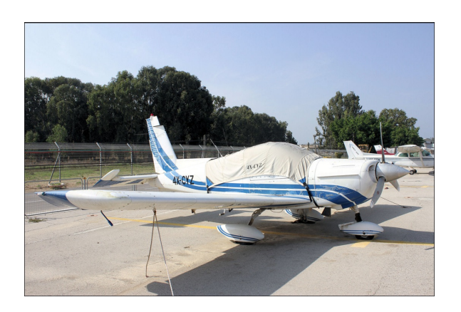
Zlin 142 Canopy Cover

Travel Covers are made with Silver Solution-Dyed Polyester fabric and only lined over the windshield to save weight. The material is lightweight and more compact for easy stowage in the aircraft. The polyester material is water resistant, but only intended for occasional use outside. We also have an ultra lightweight material available for fitted hangar dust covers. For daily outdoor use, the non-travel Sunbrella Cover is the best choice.