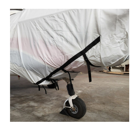
Zlin 142C Engine Cover, test fit cover

This cover type is made from Silver Acrylic Sunbrella canvas and is 100% lined with a soft and smooth microfiber. Bruce's Custom Covers developed this material combination especially for aircraft protection. The outer material is medium weight and treated for water resistance, UV resistance and anti-static buildup. The inner lining is a very soft and smooth microfiber to prevent scratching. The material is very reflective, and tests show that the cabin interior temperature can be reduced to near-ambient temperature on the hottest of days. It is water, ice and snow repellent, yet breathable to allow moisture to escape from between the cover and the aircraft surface.