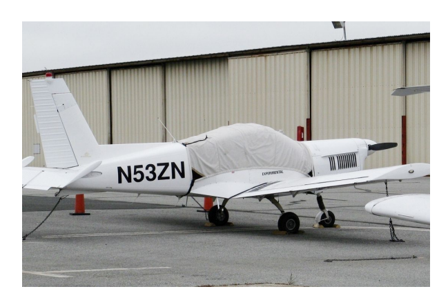
Zlin 142 Canopy Cover

This cover type is made from Silver Acrylic Sunbrella canvas and is 100% lined with a soft and smooth microfiber. Bruce's Custom Covers developed this material combination especially for aircraft protection. The outer material is medium weight and treated for water resistance, UV resistance and anti-static buildup. The inner lining is a very soft and smooth microfiber to prevent scratching. The material is very reflective, and tests show that the cabin interior temperature can be reduced to near-ambient temperature on the hottest of days. It is water, ice and snow repellent, yet breathable to allow moisture to escape from between the cover and the aircraft surface.