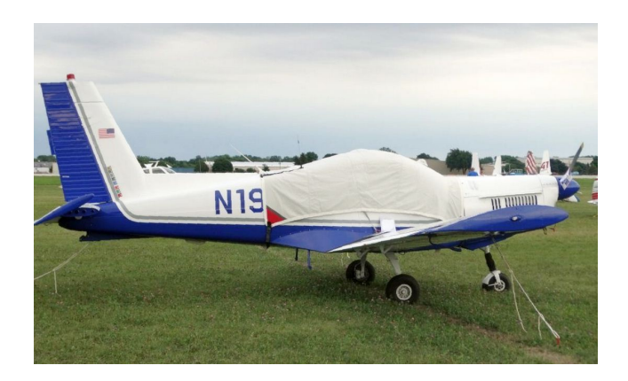
Zlin 142 Canopy Cover