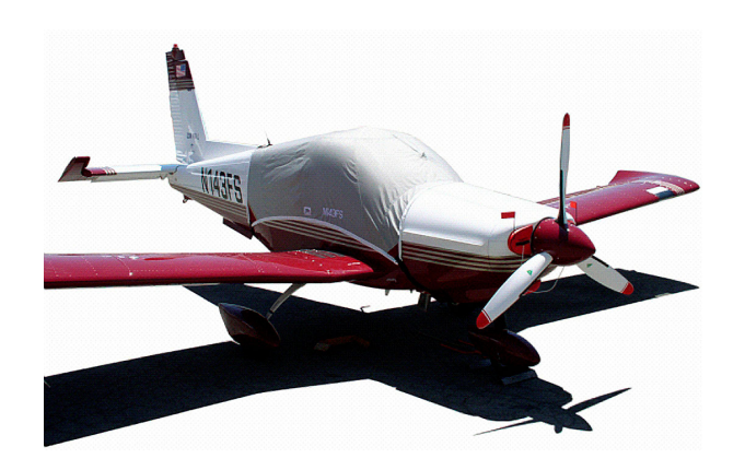
Zlin 143 Canopy Cover and Engine Plugs