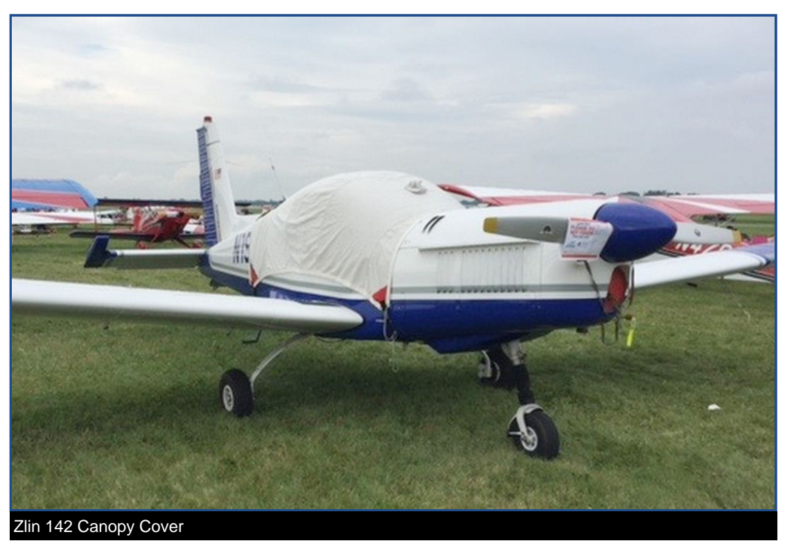
Section 1: Canopy/Cockpit/Fuselage Covers

Canopy Covers help reduce damage to your airplane's upholstery and avionics caused by excessive heat, and they can eliminate problems caused by leaking door and window seals. They keep the windshield and window surfaces clean and help prevent vandalism and theft.