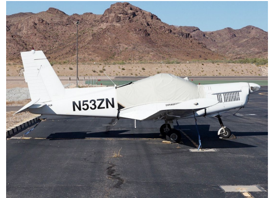
Zlin 142 Canopy Cover