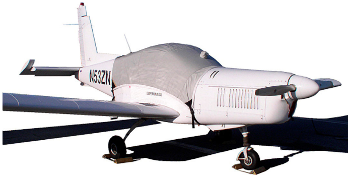
Zlin 142 Canopy Cover

The Zlin 42 Canopy/Engine Cover is a one-piece cover (100% lined with microfiber) that is a combination of the Canopy Cover and Engine Cover. This cover will enclose the engine cowl and will extend aft to cover all of the windows. This cover type is made from Silver Acrylic Sunbrella canvas and is 100% lined with a soft and smooth microfiber. Bruce's Custom Covers developed this material combination especially for aircraft protection. The outer material is medium weight and treated for water resistance, UV resistance and anti-static buildup. The inner lining is a very soft and smooth microfiber to prevent scratching. The material is very reflective, and tests show that the cabin interior temperature can be reduced to near-ambient temperature on the hottest of days. It is water, ice and snow repellent, yet breathable to allow moisture to escape from between the cover and the aircraft surface.