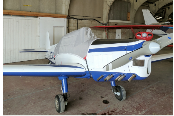
Zlin 326 Travel Cover