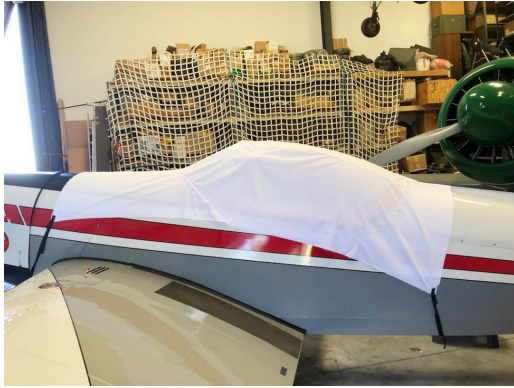
Zlin 526 Canopy Cover, test fit cover

Travel Covers are made with Silver Solution-Dyed Polyester fabric and only lined over the windshield to save weight. The material is lightweight and more compact for easy stowage in the aircraft. The polyester material is water resistant, but only intended for occasional use outside. We also have an ultra lightweight material available for fitted hangar dust covers. For daily outdoor use, the non-travel Sunbrella Cover is the best choice.