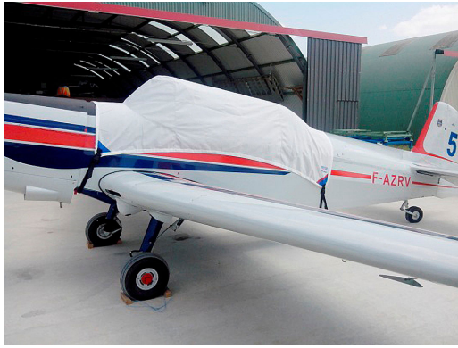
Zlin 526 Canopy Cover

the hottest of days. It is water, ice and snow repellent, yet breathable to allow moisture to escape from between the cover and the aircraft surface.